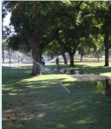
Antiquated Heartwell irrigation system

The year starts on a high note with the Department still celebrating their Gold Medal award for Excellence in Parks and Recreation Management from the National Parks and Recreation Association. Another major accomplishment in 2014 was the installation of the temporary Belmont Plaza Pool to serve residents until a new aquatics complex is in place.