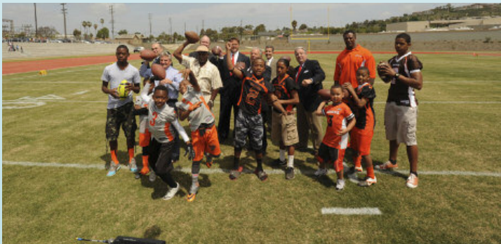
The Chittick Track and Sports Field Facility Opened on April 23, 2014

The Department is extremely pleased with the continued investments identified in the new 2014-2015 budget and is thankful for the support of the City Council.