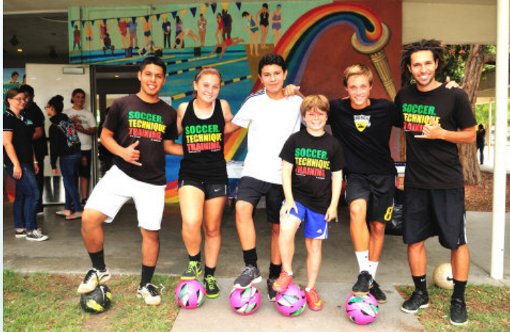
Kidz Love Soccer Team Ready to Kick It

Residents got a preview of Parks, Recreation and Marine's fall recreation classes at the "Fall Class Expo on August 9. Residents had the opportunity to register early for fall classes, as well as see class demonstrations and meet instructors during the expo. The demonstrations including Mexican Dance, Futsal, Voice/Music, Hula Dance, Ukulele, Belly Dancing, Martial Arts, Fitness, Zumba, Tap Dance, Woodworking, Soccer and Readwrite and Write On! Child Enrichment classes. Everyone who registered for a class at the Fall Class Expo received a $5 credit toward a future class.