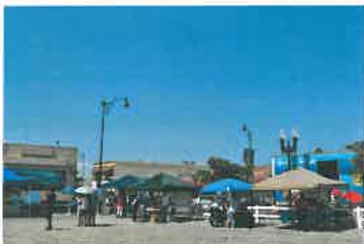
A sunny summer day made for a great event.