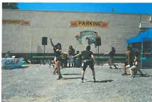
Dancers showed everyone how it's done.

The entertainment included dancers and musicians from the Cultural Alliance of Long Beach and an open mic, where children sang songs from their favorite television shows and the ever-popular movie Frozen. Fellow vendors included the Aquarium of the Pacific, Covered California, Long Beach Water, the Childhood Lead Poisoning Prevention Program, Long Beach Beekeepers, and the Long Beach Human Trafficking Task Force.