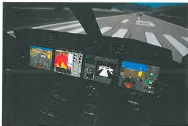
A pilot's view of the Gulfstream G650 Simulator

FlightSafety International's third Gulfstream G650 aircraft simulator has been qualified to Level D by the United States Federal Aviation Administration (FAA).