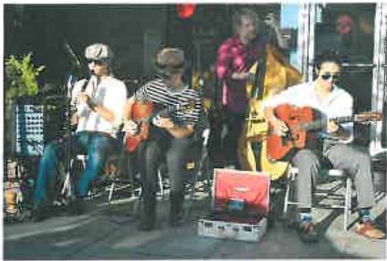
Hedgehog Swing provided retro tunes.