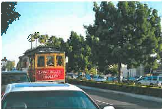
The Long Beach Trolley ran up and down Atlantic Ave.