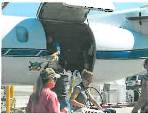
Volunteers loaded the precious cargo with care.

Wings of Rescue: saving the day, one animal at a time.