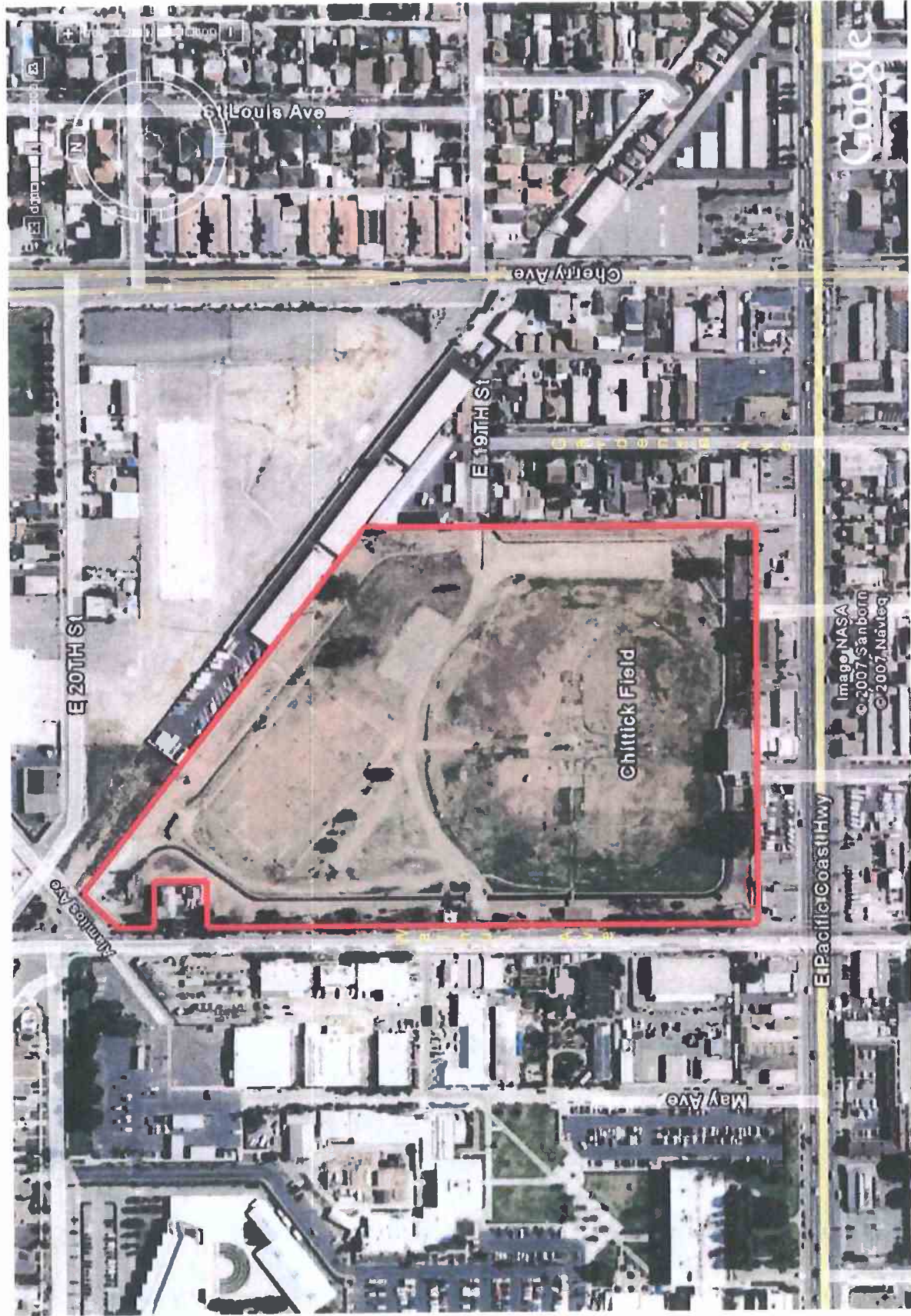
Chittick Field – Hamilton Bowl