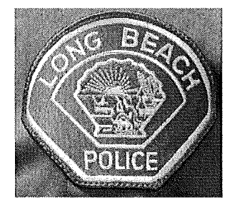
LBPD Shoulder Patch Subdued