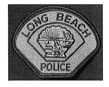
LBPD Shoulder Patch Green