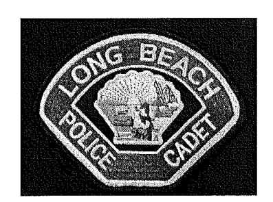
LBPD Cadet Shoulder Patch