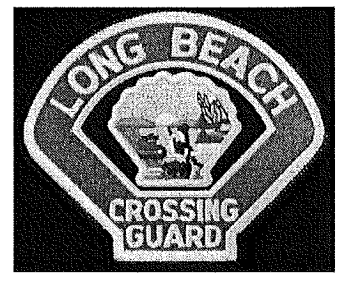
LB Crossing Guard Shoulder Patch