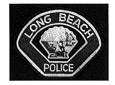
LBPD Shoulder Patch