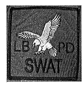
LBPD Swat Patch