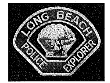
LBPD Explorer Shoulder Patch