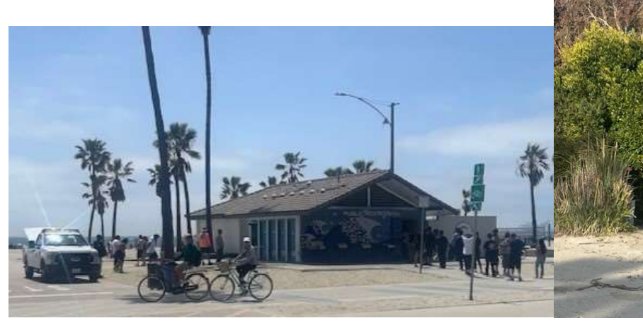
Lack of Restroom Access