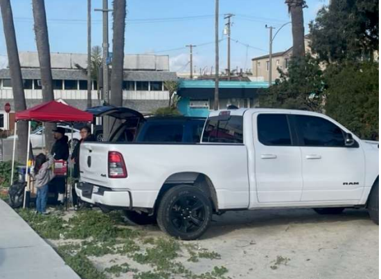
Illegal Parking and Damage to Vegetation and Infrastructure