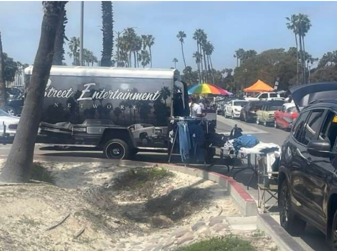
Cars lined the Emergency Access Lane