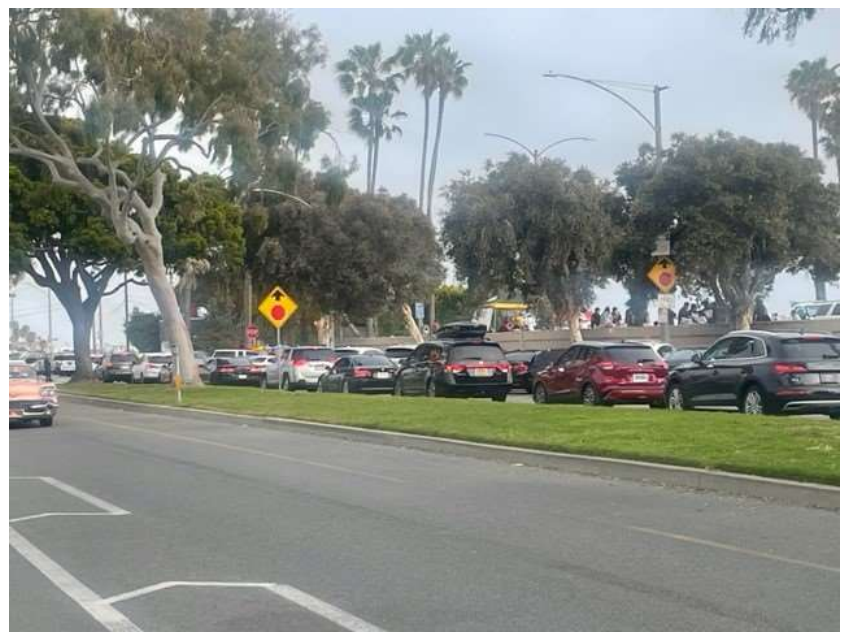
Unmitigated Traffic Impacts