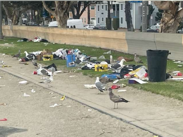
Unsanitary Conditions due to Trash Build Up Following Event