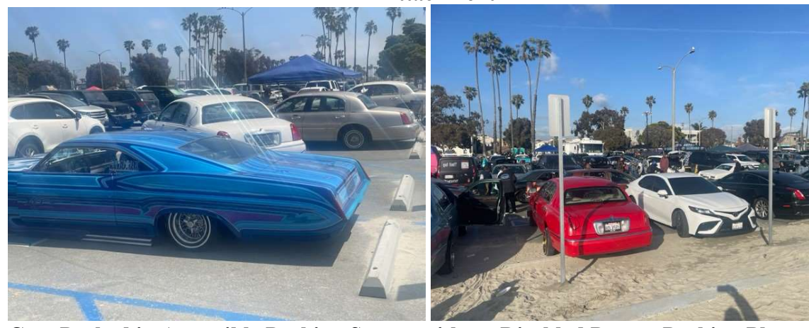
Cars Parked in Accessible Parking Spaces without Disabled Person Parking Placards & Plates