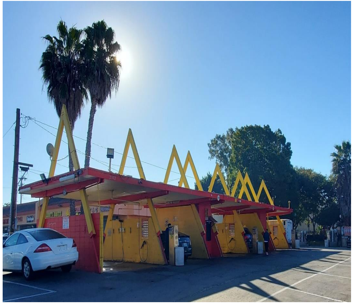
595 Pacific Coast Highway