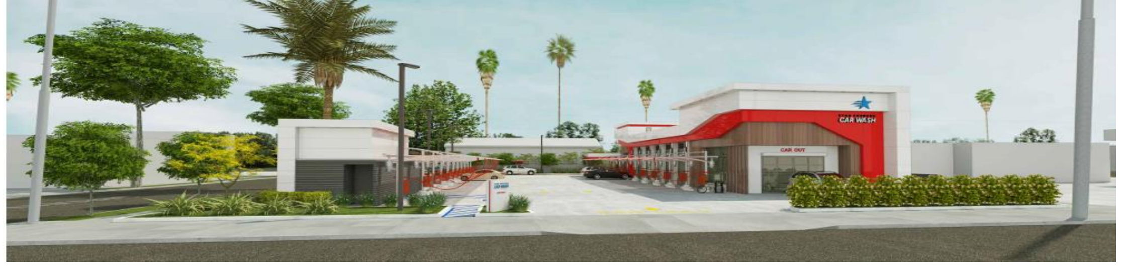
View from Pacific Coast Highway