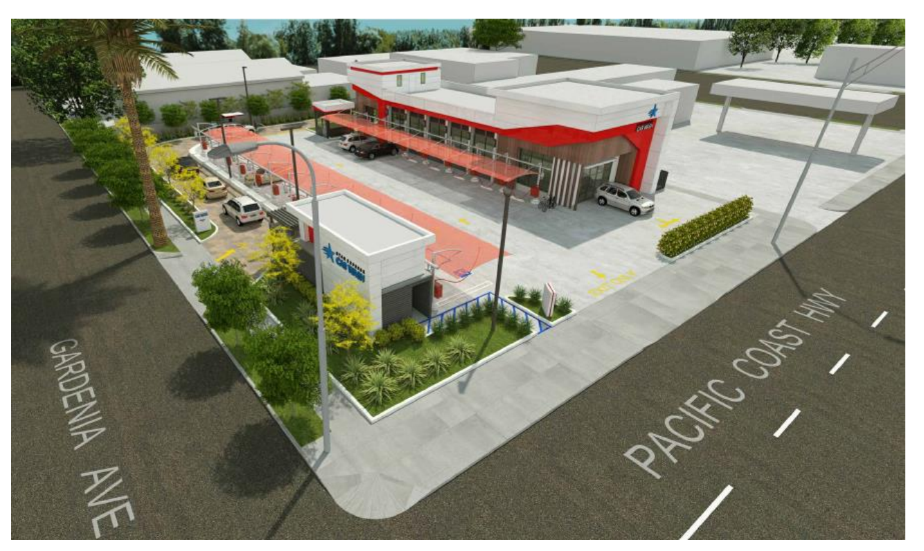
View from corner of Gardenia Ave/Pacific Coast Highway