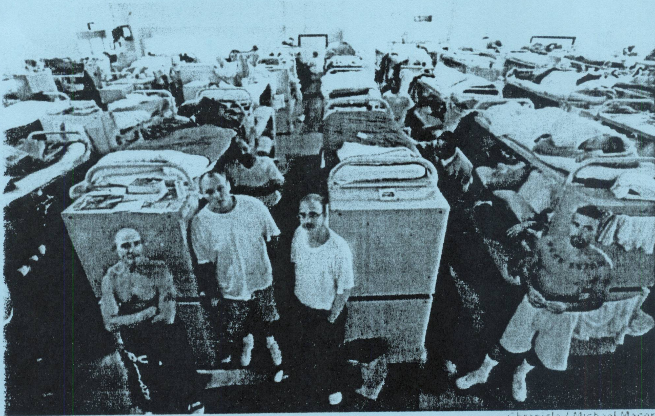
Inmates sleep in

three-high bunks in a gymnasium due to overcrowding at the Pleasant Valley State Prison in Coalinga, one the most overcrowded prisons in California.