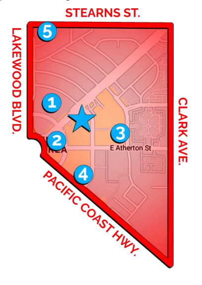
Figure 2 – Map of Existing ABC Licenses in Census Tract 5749.02