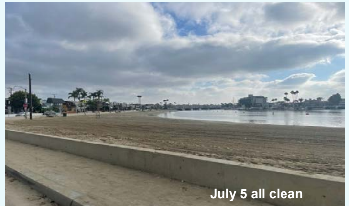
July 5 all clean

Maintenance staff recently coordinated and the painting the Nautical Star in front of the Pierpoint building. The star was long overdue for new paint and the end results looks great!