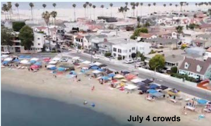
July 4 crowds