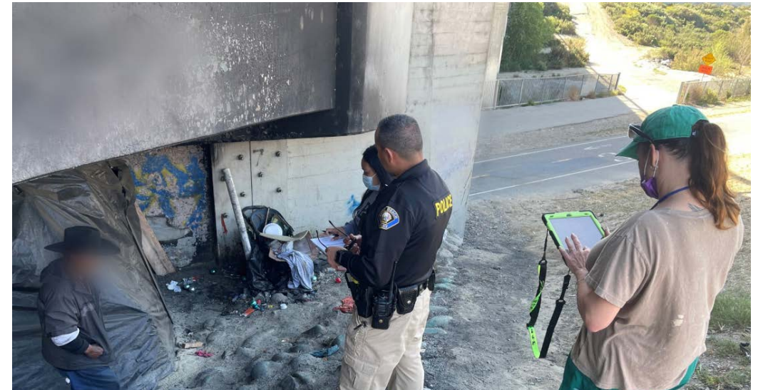
Quality of Life Team members visit local encampments to offer services.