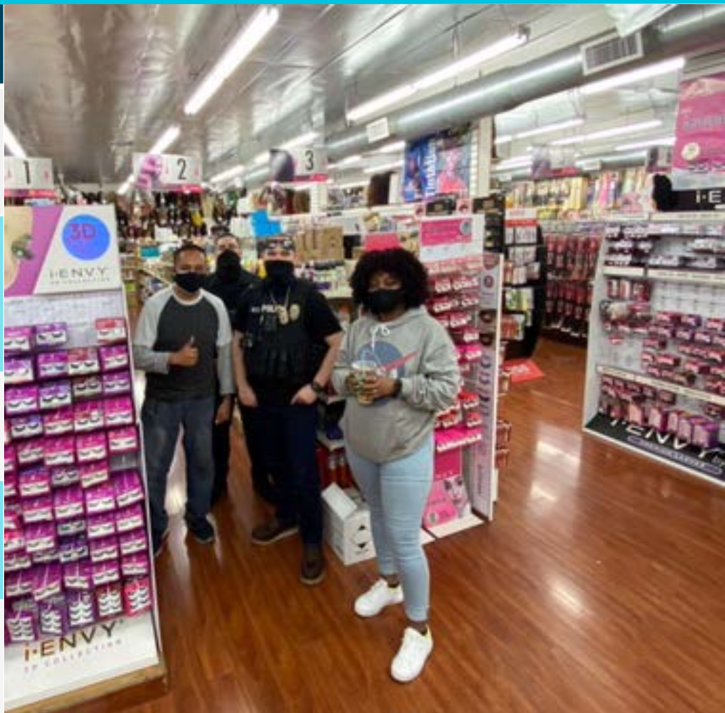
Coordinated Response Team members visit local businesses.