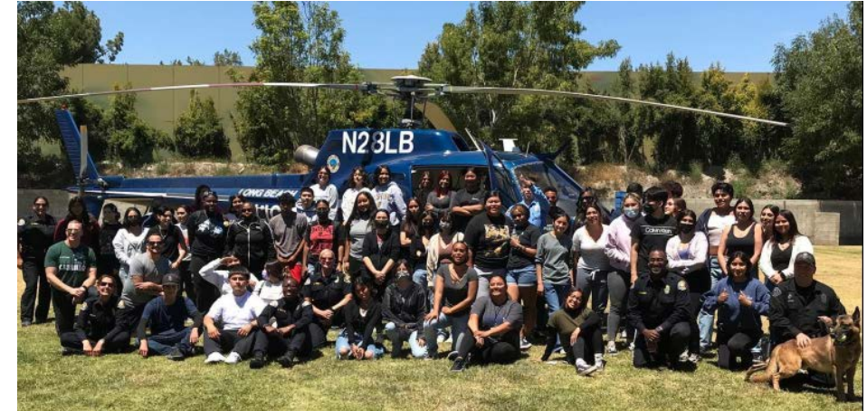
The Cabrillo High School Criminal Justice Club spends the day at the LBPD Academy.