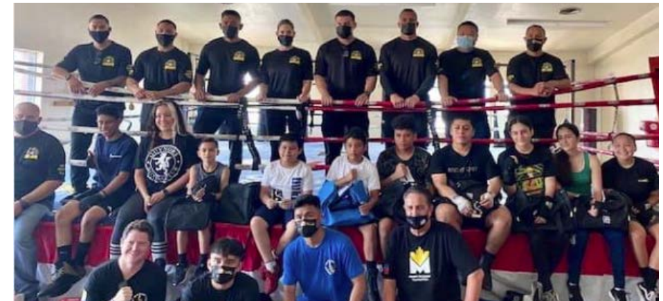
LBPD boxing team, community partners and local kids they are helping to mentor and coach.