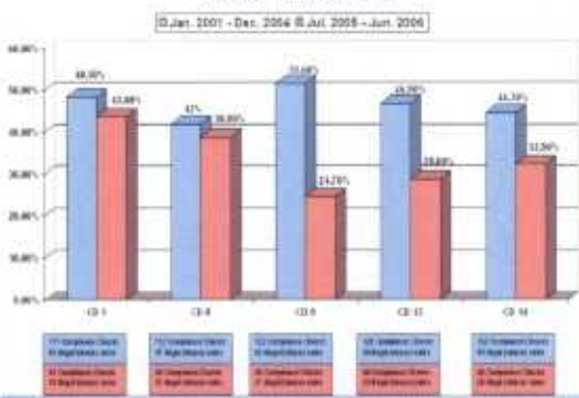
2005/2006 EXPANDED ENFORCEMENT EFFORTS IN COUNCIL DISTRICTS WITH THE HIGHEST ILLEGAL SALES RATE RESULT: Decrease in illegal sales rate