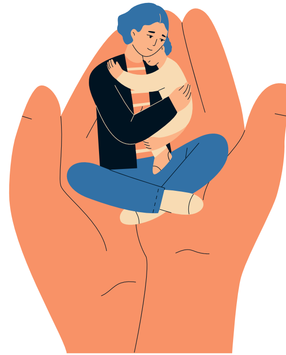
Funding & Donations