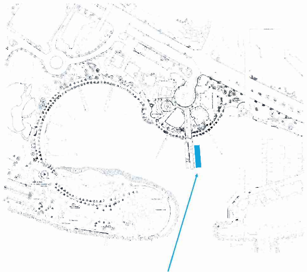
Proposed Mooring Location for American Pride Pine Avenue Pier