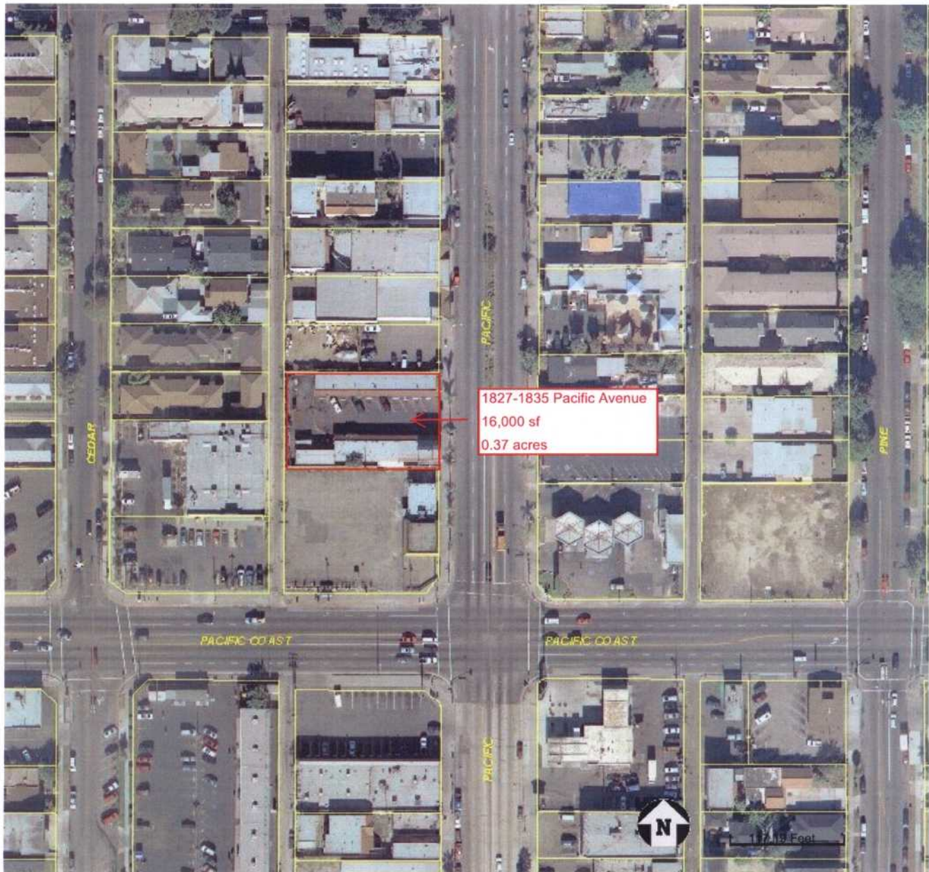
Exhibit A - Site Map