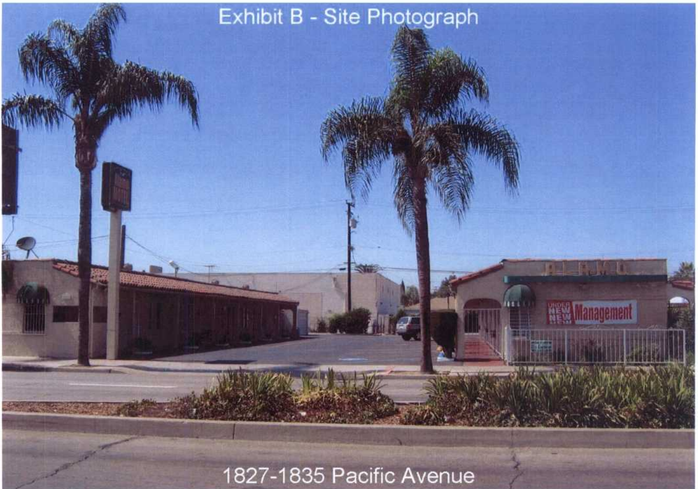
1827-1835 Pacific Avenue