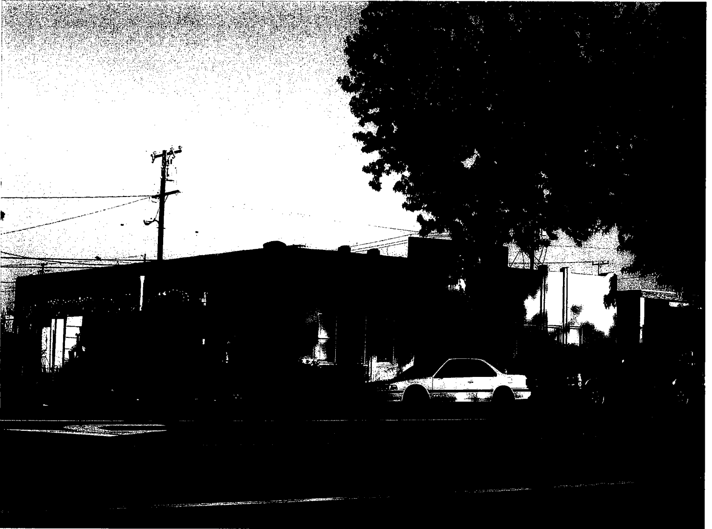
Exhibit B 1565 Santa Fe Avenue