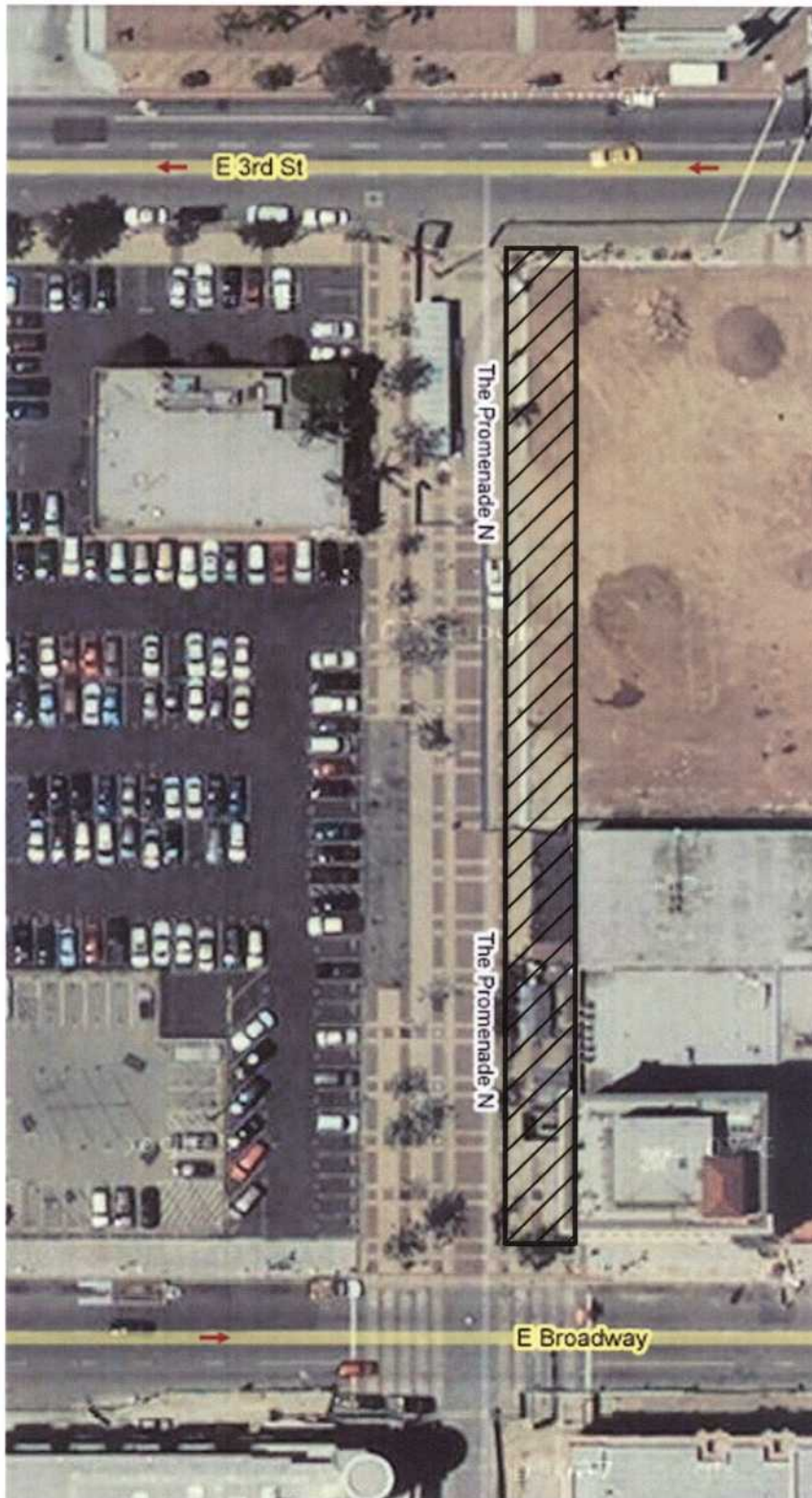
PROMENADE NORTH BLOCK - INTERIM PLAN