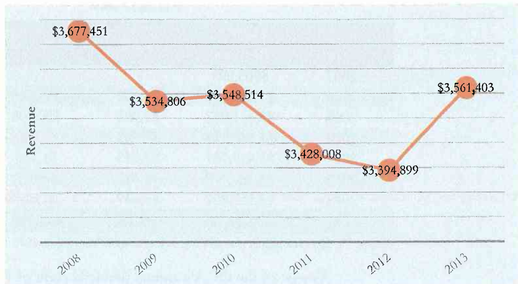
Chart 4. Prop H Annual Revenues FYs 2008-2013

Note: Excludes FY 2007 tax revenues, which does not represent a full year.