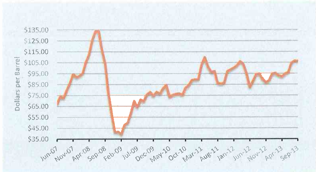
Chart 3. Price of Crude Oil, WTI Index June 2007 – September 2013

However, the oil price declined significantly shortly thereafter, with the average monthly WTI index falling to $39.16 per barrel