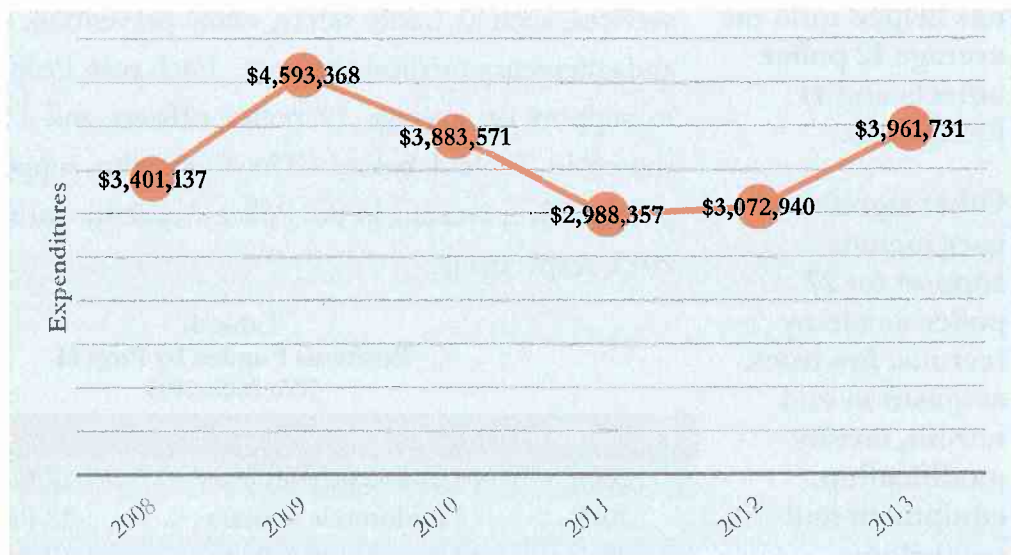
Chart 5. Total Prop H Expenditures FYs 2008-2013

Note: There were no expenditures during FY 2007.