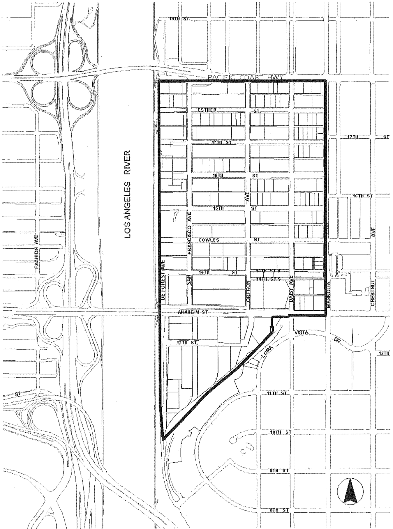
Magnolia Industrial Group Business Improvement District