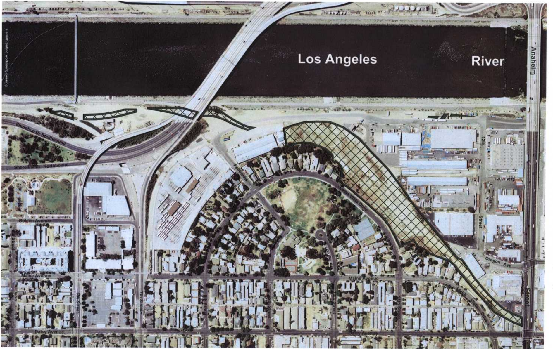
Attachment "B" - Union Pacific Property