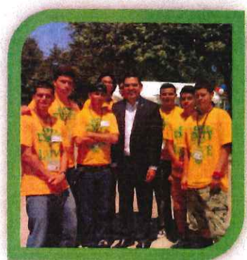
West Side Youth Squad with Mayor