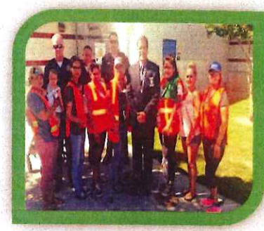
Parent Safety Ambassadors with Long Beach police Chief Robert Luna

TESORO Foundation's generous community investment of $330,000 helps to fill an identified gap and provide needed resources for safety prevention and intervention in vulnerable high crime school for our community efforts to build social connections in neighborhoods, strengthen ties (characterized by trust, concern for one another, willingness to take collective action for the community good, and increased social sanctions against violent behaviors) among neighbors and community members to help ensure safe passage through a two-year implementation and case study and community safety trainings and services, utilizing evidence based best practices on the Santa Fe Corridor for 5 vulnerable community-School areas; More than 4,800 Students served Under the Overall program enhancement in the 2015-2016 School Year