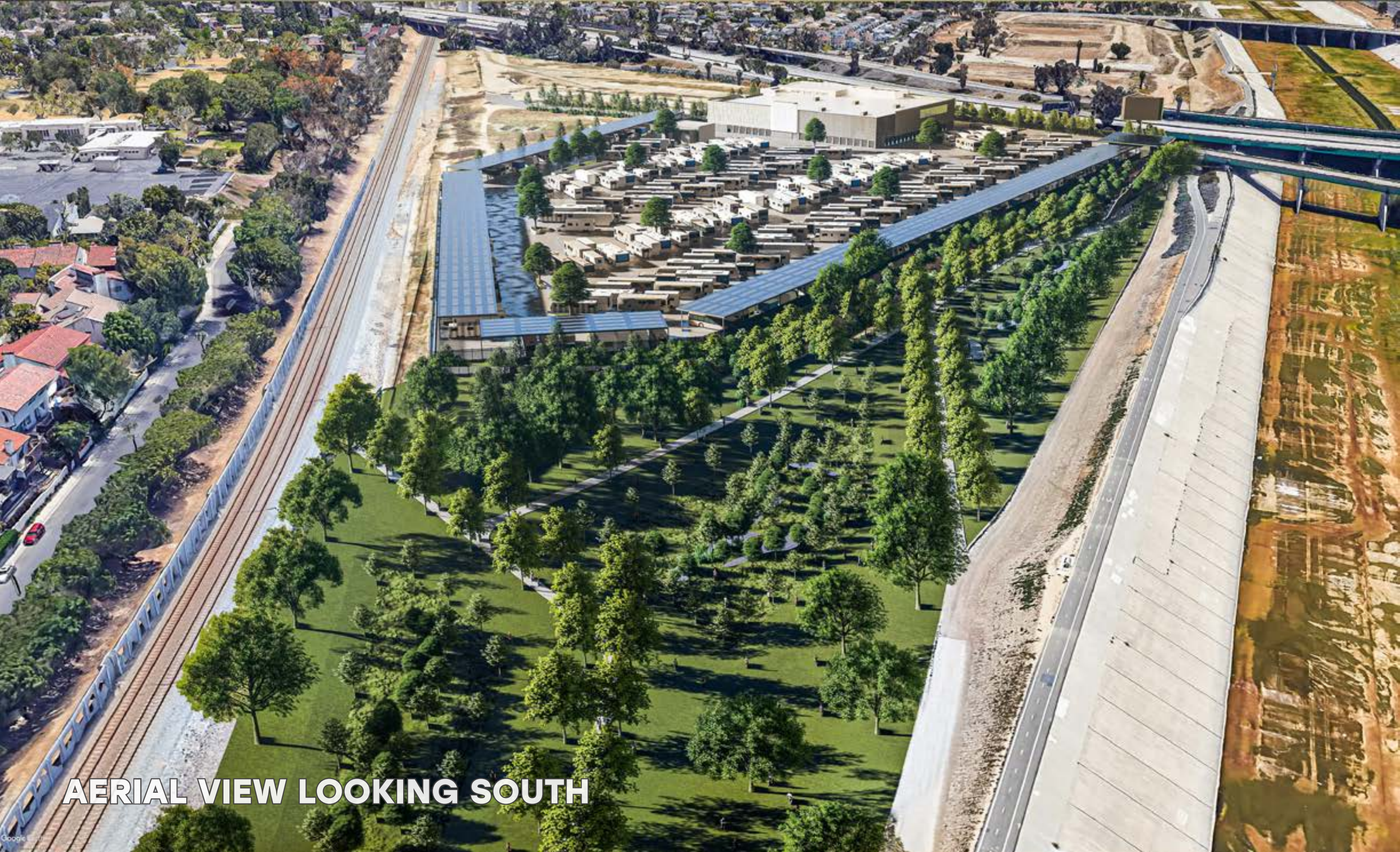
AERIAL VIEW LOOKING SOUTH