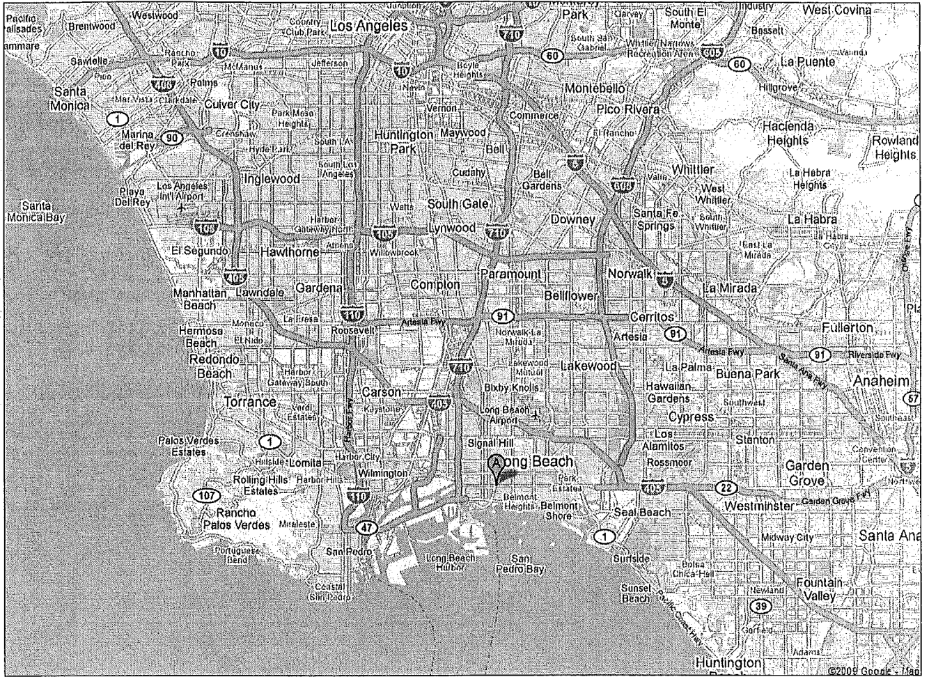
Figure 1: Regional Project Location