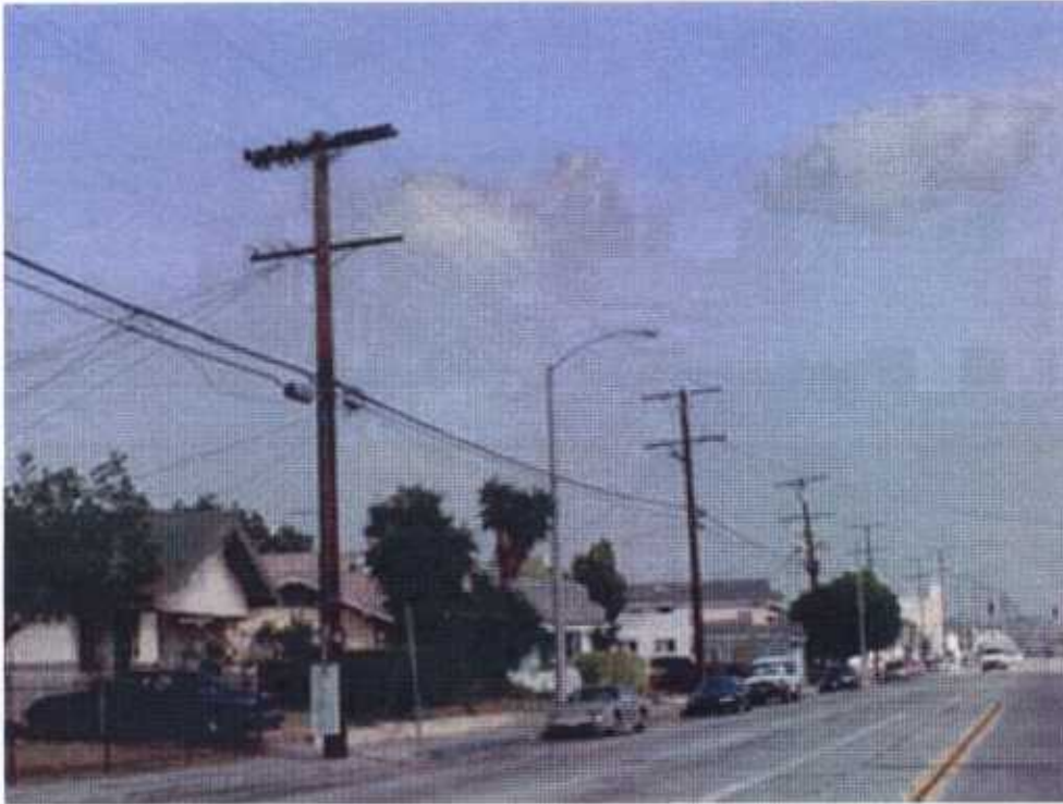
Tall poles march up the west side of the boulevard.