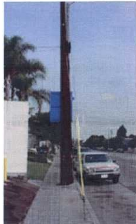
Utility poles in narrow sidewalks are ADA problems