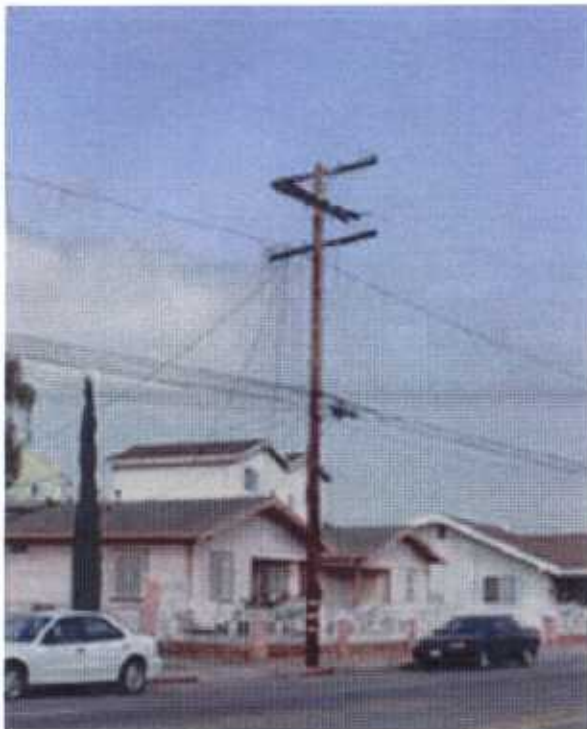
Houses are typically fed off of the street