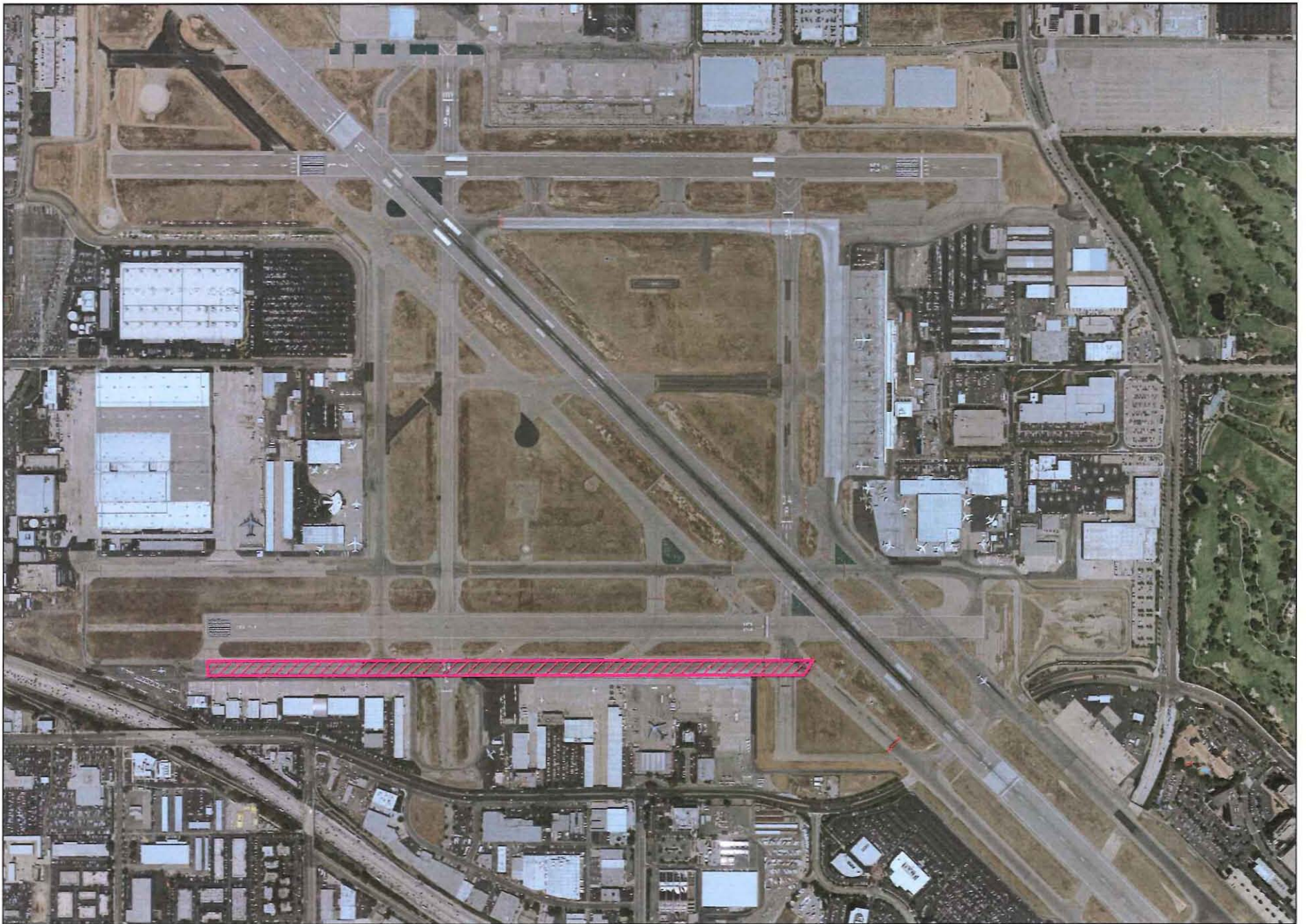
RECONSTRUCTION OF TAXIWAY F