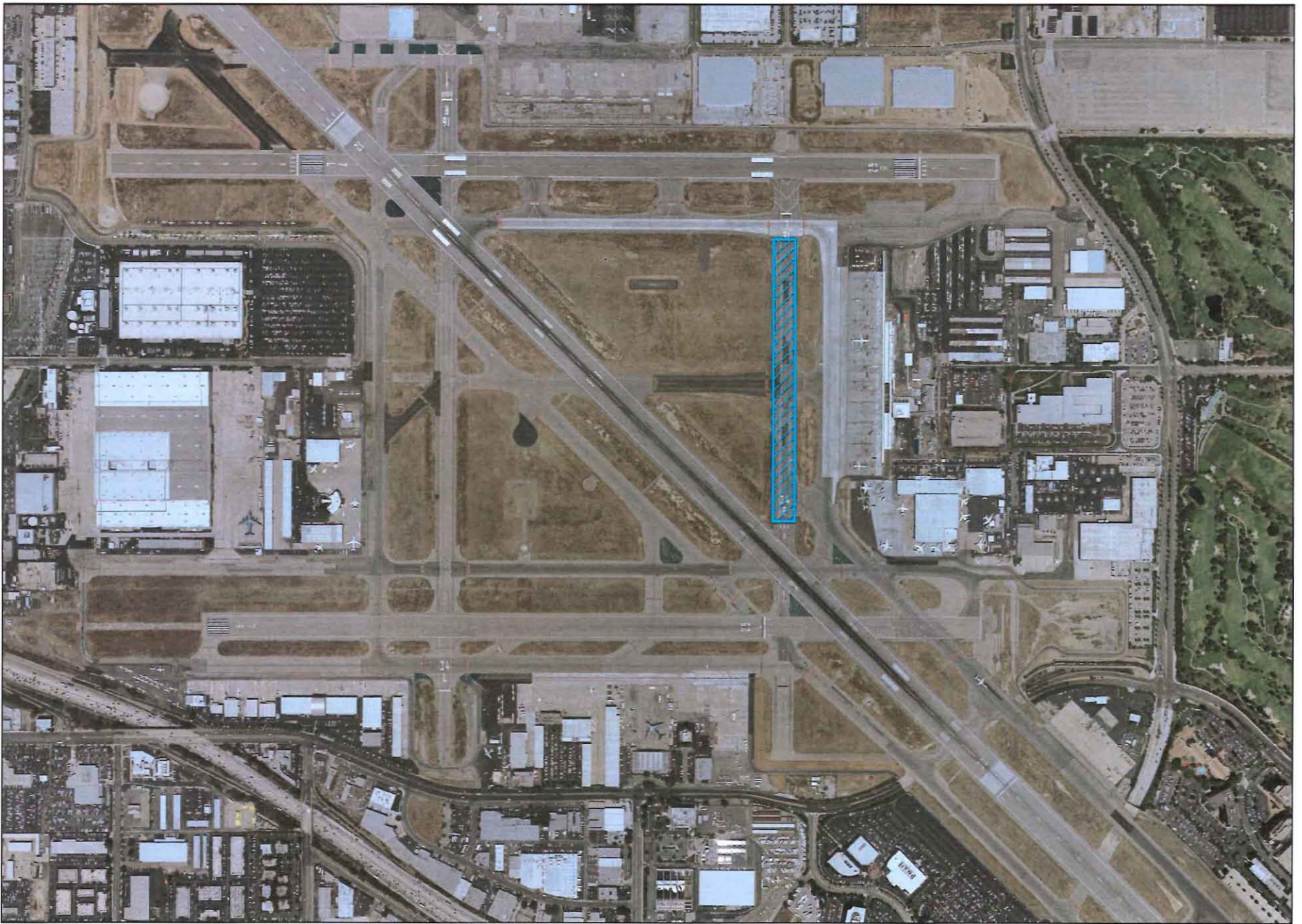
CONVERSION OF FORMER RUNWAY 16L-34R INTO TAXIWAY C