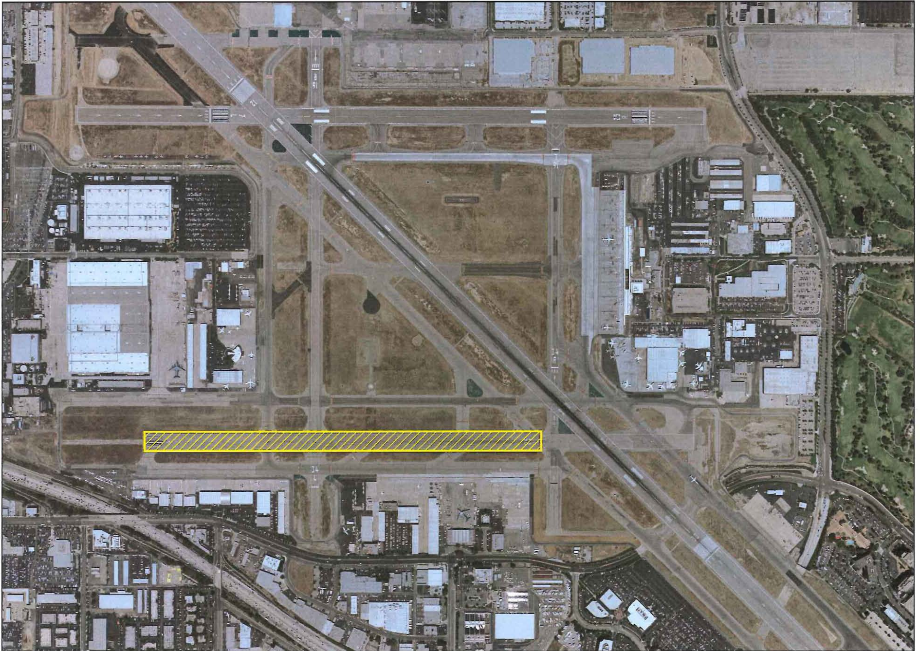
RECONSTRUCTION AND SHORTENING OF RUNWAY 7R-25L