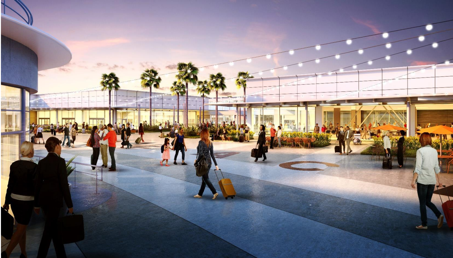
Meeter Greeter Plaza