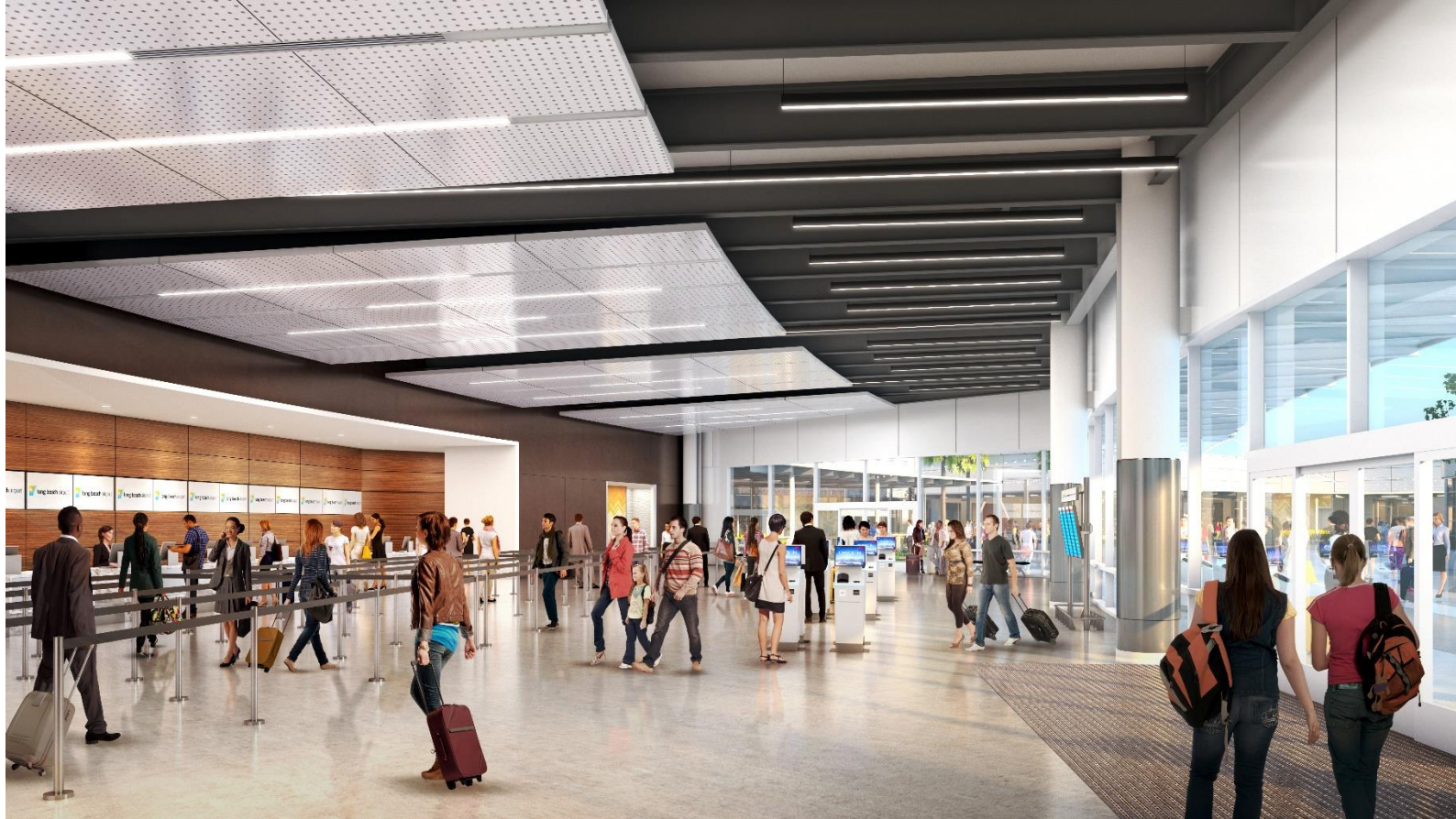
New Ticketing Building