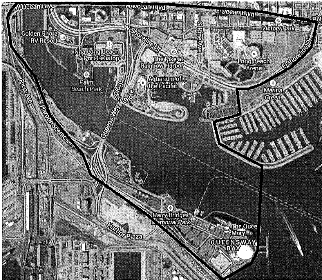
Exhibit A, page 1 of 2