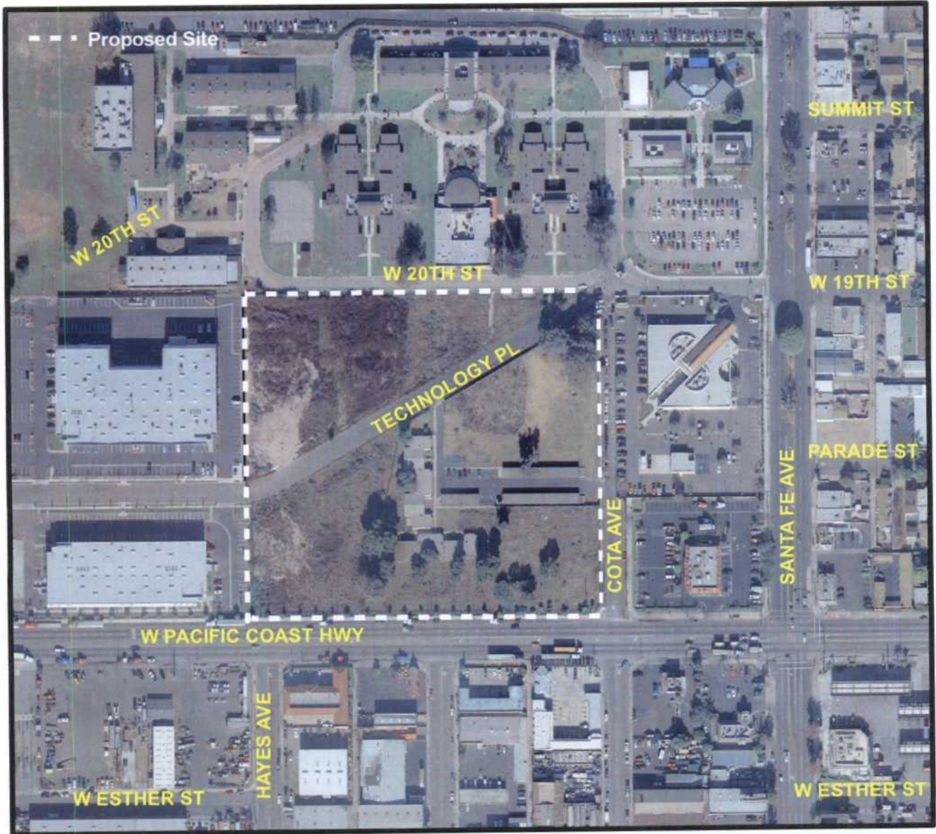
EXHIBIT A - SITE MAP