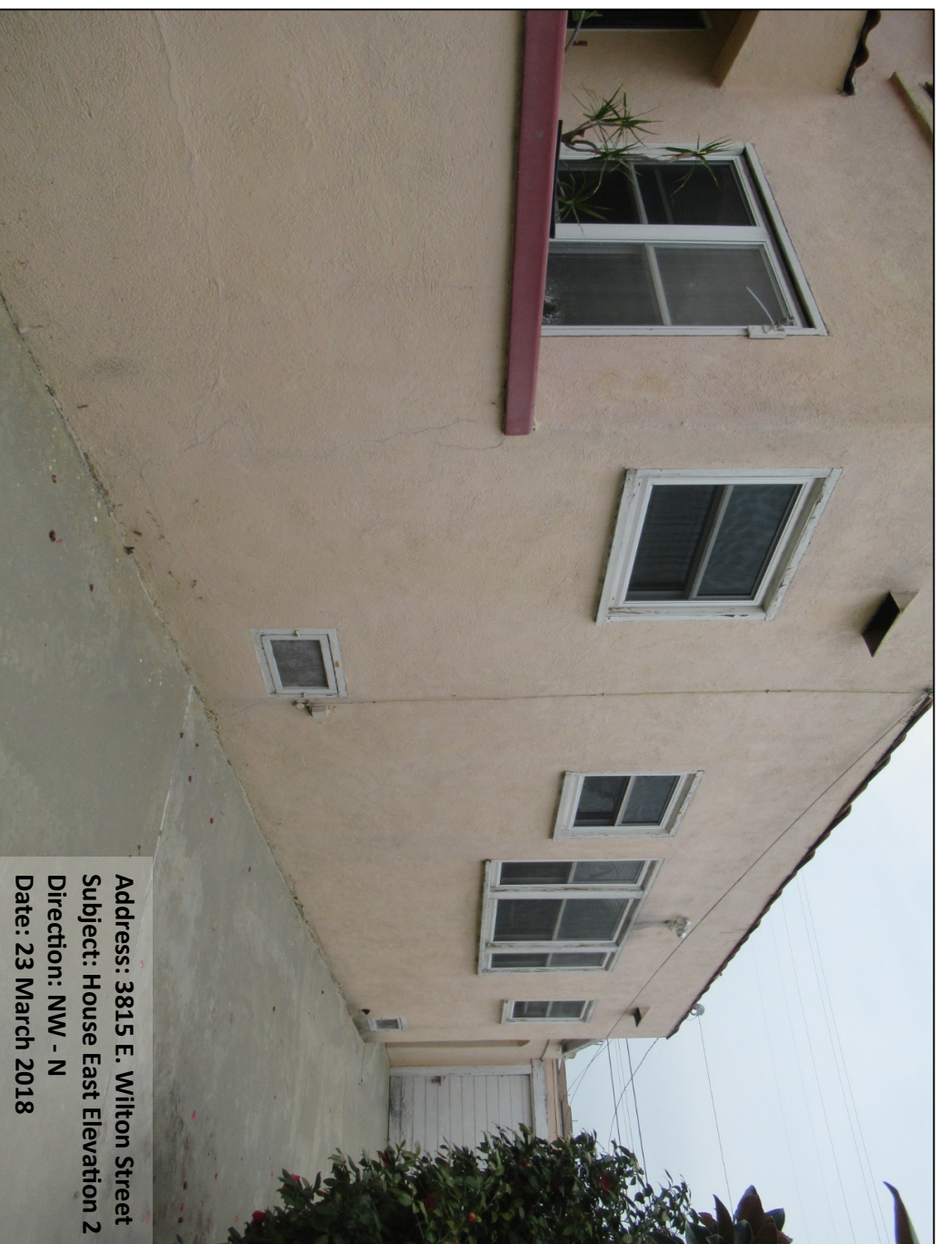
Address: 3815 E. Wilton Street Subject: House East Elevation 2 Direction: NW - N Date: 23 March 2018