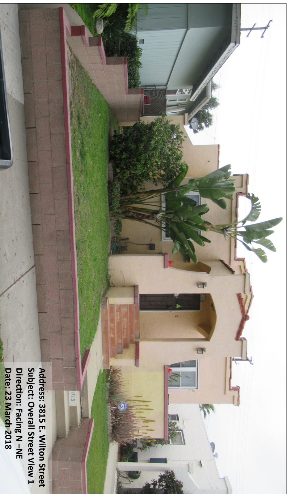
Address: 3815 E. Wilton Street Subject: Overall Street View 1 Direction: Facing N-NE Date: 23 March 2018