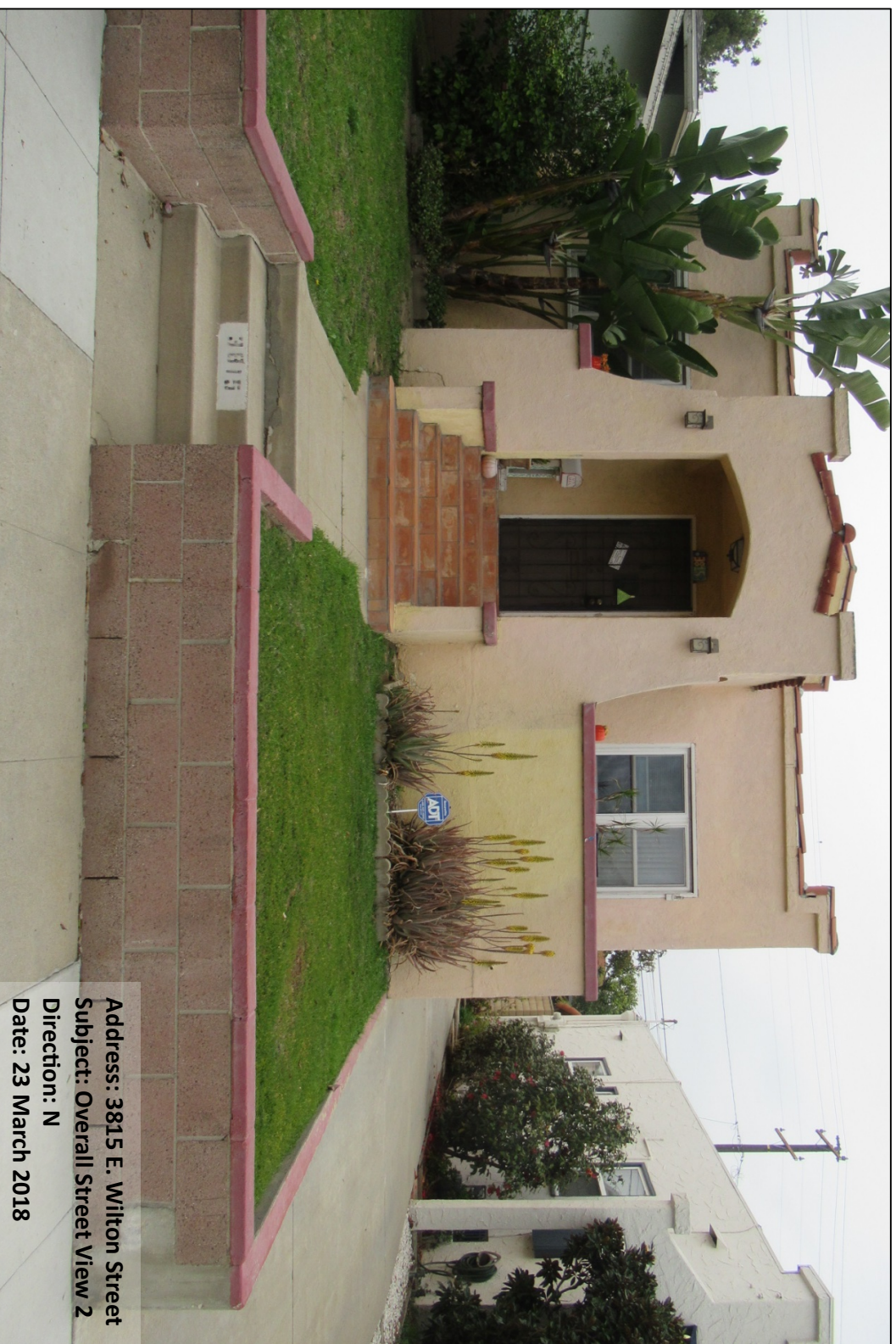
Address: 3815 E. Wilton Street Subject: Overall Street View 2 Direction: N Date: 23 March 2018