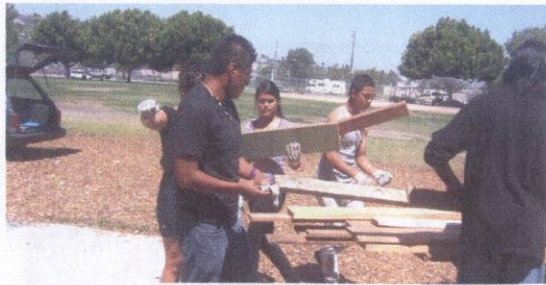
Green Team uses vintage wood for the PEACE GARDEN

The PEACE GARDEN and the Long Beach City College Horticulture Department has partnered to educate gardeners on seed saving techniques. A Water Reservation, created from the rains is currently under consideration as well as other water-saving techniques.