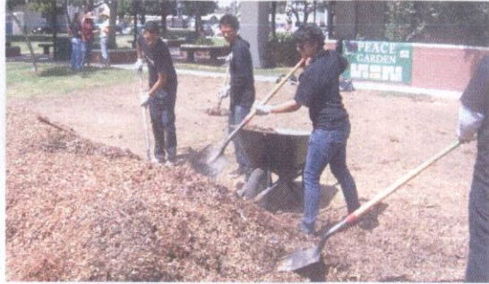
Green Team prepares mulch for PEACE GARDEN

The PEACE GARDEN is where many lasting partnerships and relationships are fostered. Community seniors partner with the youth who learn how to plant, cultivate, harvest, as well as connect to their history and the land.