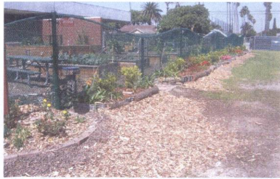
Boy Scout Eagle project added this side of the GARDEN

Learning how to grow and identify healthy organic vegetables and fruits are key objectives of the PEACE GARDEN. Master gardeners donate their time to instruct youth about seasonal crops. They teach the difference between "Heirloom" and "Hybrid" as well as how to harvest the seeds of heirloom crops and use the seeds for the next year's planting season. They also instruct about organic methods that successfully address planning disease.