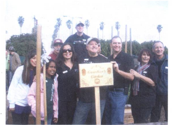
Guardians of the PEACE GARDEN

NUSA Neighborhoods USA 2011 Building Stronger Communities Multi Neighborhood Partnerships 2 nd Place Project Award Recipient