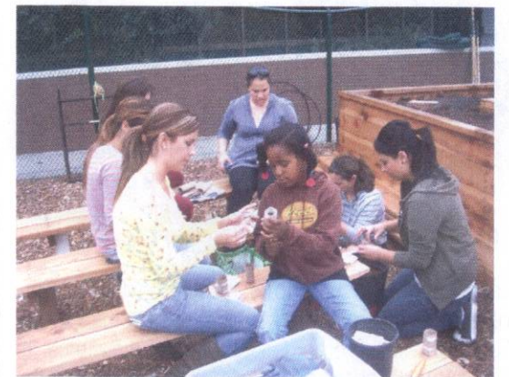
Volunteers working with youth

The LB DHHS Weed & Seed Strategy aims to prevent, control, and reduce violent crime, drug abuse and gang activity in Central Long Beach through funding provided by the U.S. Department of Justice. The strategy operates out of three safe havens at Martin Luther King Jr., Park, MacArthur Park, and McBride Senior Park as safe places for youth and families to access community resources.