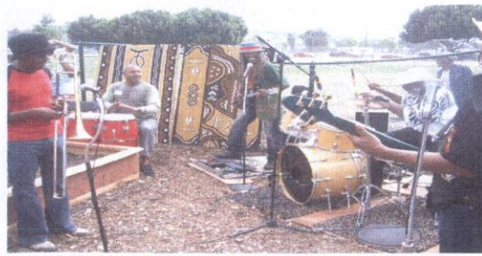
PEACE GARDEN Drum Circle performs at City events