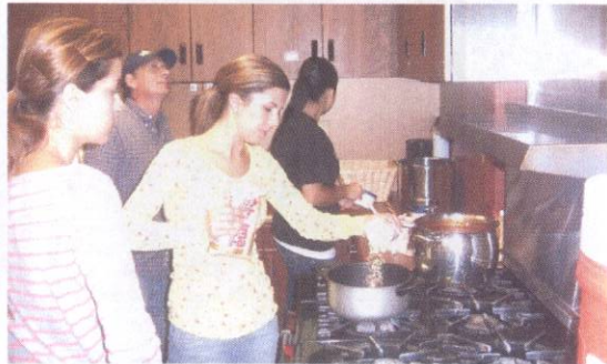
Preparing gifts of the PEACE GARDEN

The produce grown in the PEACE GARDEN represents the cultures of the Central Long Beach community. After harvest, the community joins together to fellowship and prepares different ethnic meals. Professional chefs are recruited to teach the gardeners how to prepare meals using the produce from the GARDEN.