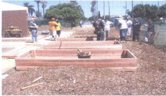
Volunteers building planter boxes