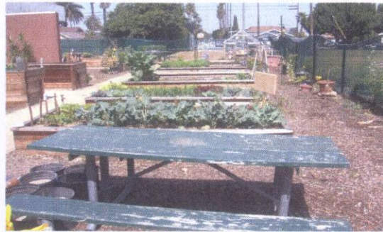
PEACE GARDEN crops are ready for harvesting