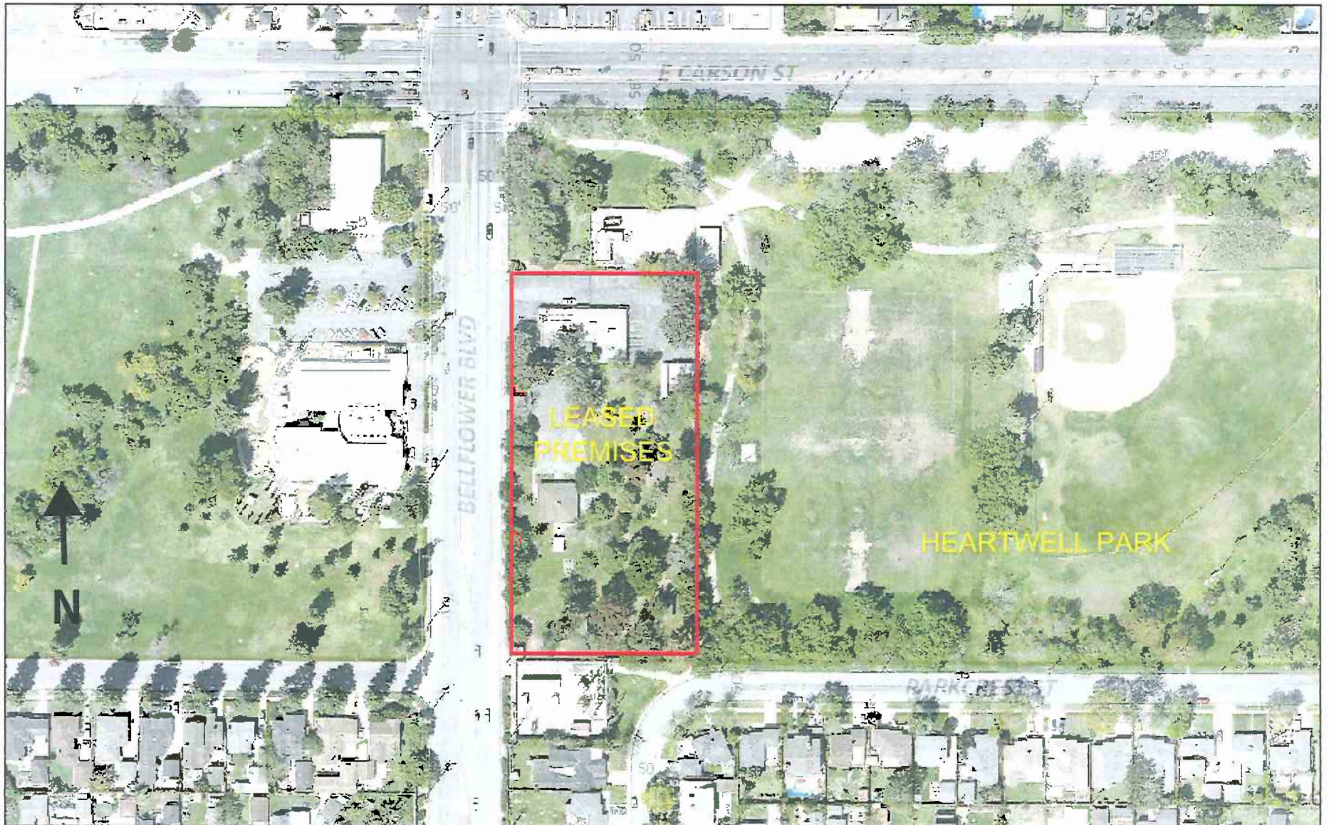
Girl Scouts of Greater Los Angeles 4040 North Bellflower Boulevard