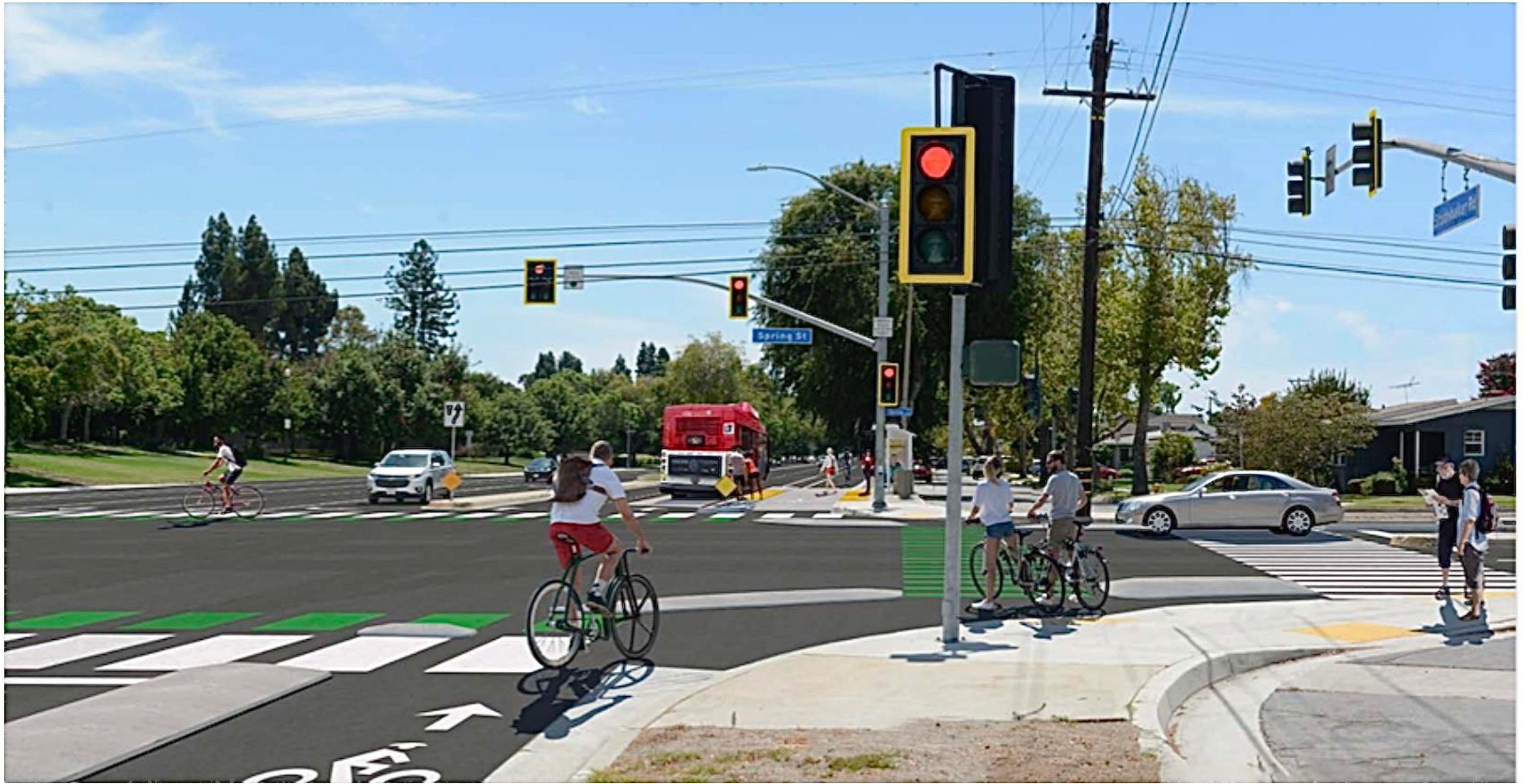
A conceptual photo looking south on Studebaker Road at the intersection of Spring Street.