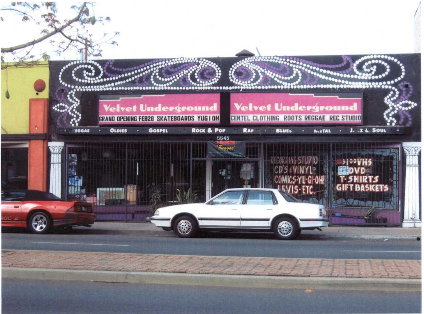
Exhibit B 5645 Atlantic Avenue