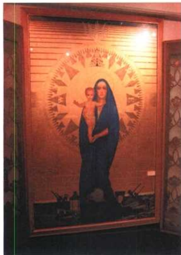
City ID#: LB021893