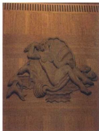
City ID#: LB090070