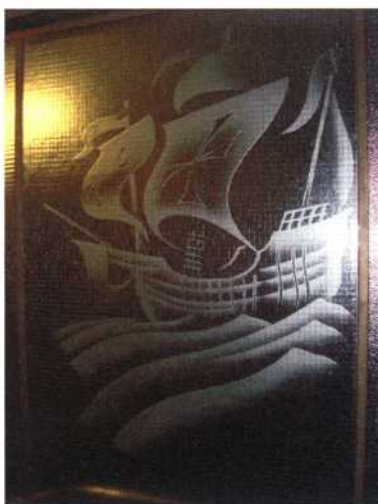
City ID#: LB90064