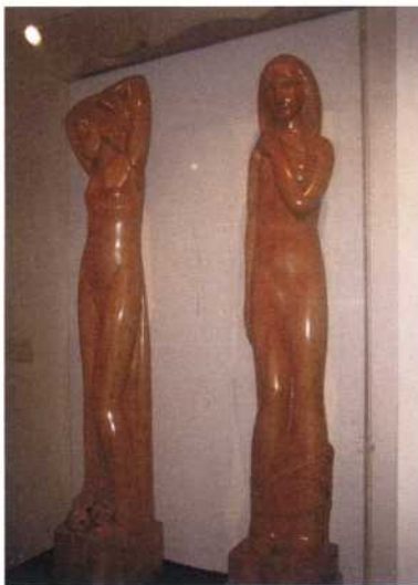
City ID#: LB023229