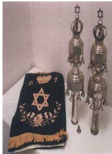
City ID#: LB090012