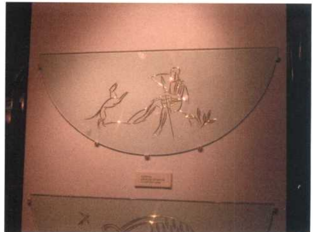
Etched Cabinet Top

*Asset was on 1998 Report but not on 2007 Report