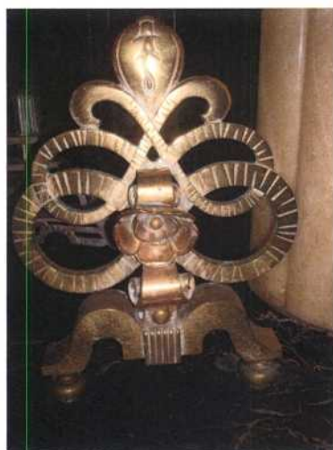
City ID#: LB090022