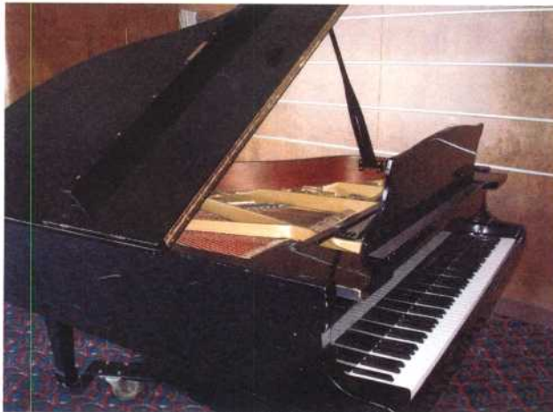
City ID#: LB0009352*

*Asset was on 1998 Report but not on 2007 Report