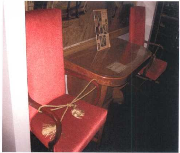
Chairs with Art Deco Table