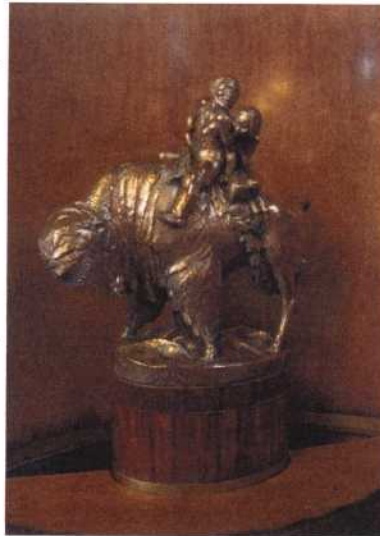
City ID#: LB090090