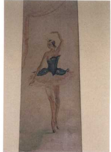
City ID#: LB090098