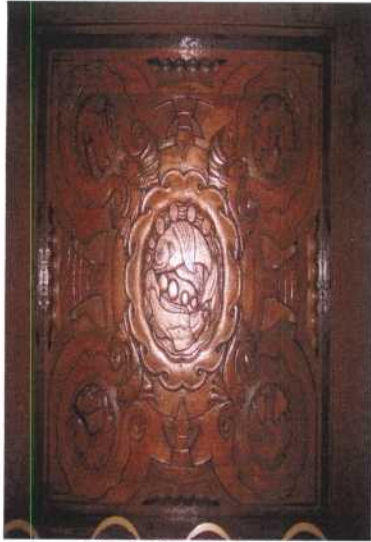
City ID#: LB090080