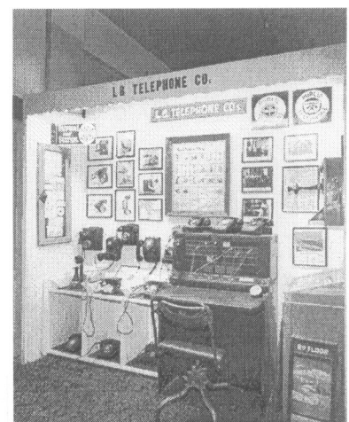
Long Beach Telephone Companies 1908-1968

In February of 1971, Long Beach's first History Museum was open at the northwest corner of First Street and Linden Avenue, then called the Queen of the Beaches Museum. After a few years, the museum moved to Third and Elm, just east of the main post office downtown. It was then renamed the Long Beach Heritage Museum. Among the many activities at the Museum was the presentation of historical movies, slide shows and exhibits of historical documents and other memorabilia found in the collection. In 1994, the Museum's 1917 building on Third Street was declared as substandard by the city building safety department and was demolished. The Museum was forced to move its collections into storage, denying residents of and visitors to Long Beach an opportunity to learn firsthand from this page of our history.