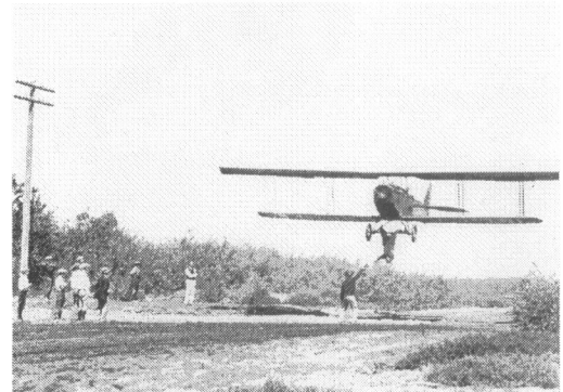
Earl Daugherty performing air stunts (barnstorming)

After moving the collection and storing additional memorabilia in the garages of family and friends, the Long Beach Heritage Museum must relocate its collection once more. Fortunately, documents and photos from the collection have found a semi-permanent home with willing volunteers at the Long Beach Senior Center on Fourth Street and Seaside Printing. However, there is still a need to unite the collection under one roof in a new location and complete an inventory of artifacts.