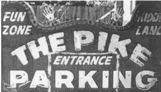
Pike Neon Parking Lot Sign LB

Pacific Coast Club, church pews, City Hall files, an old wooden public telephone booth, household furniture & kitchen appliances, silverware from the famous Hotel Virginia dining room and thousands of photos, rare photographs, and historic documents donated by residents capturing life in Long Beach during several eras.