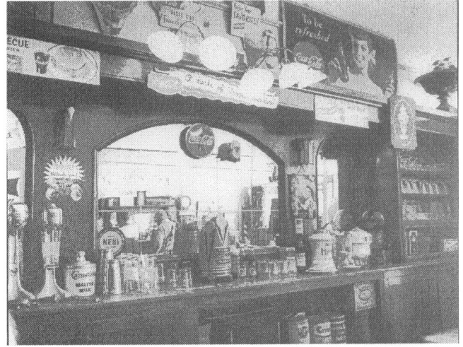
Harriman Jones Clinic drugstore fountain on display along with the back bar