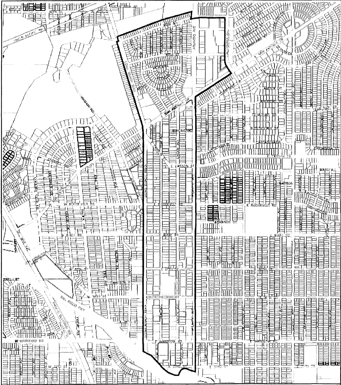
Bixby Knolls Parking and Business Improvement Area Map