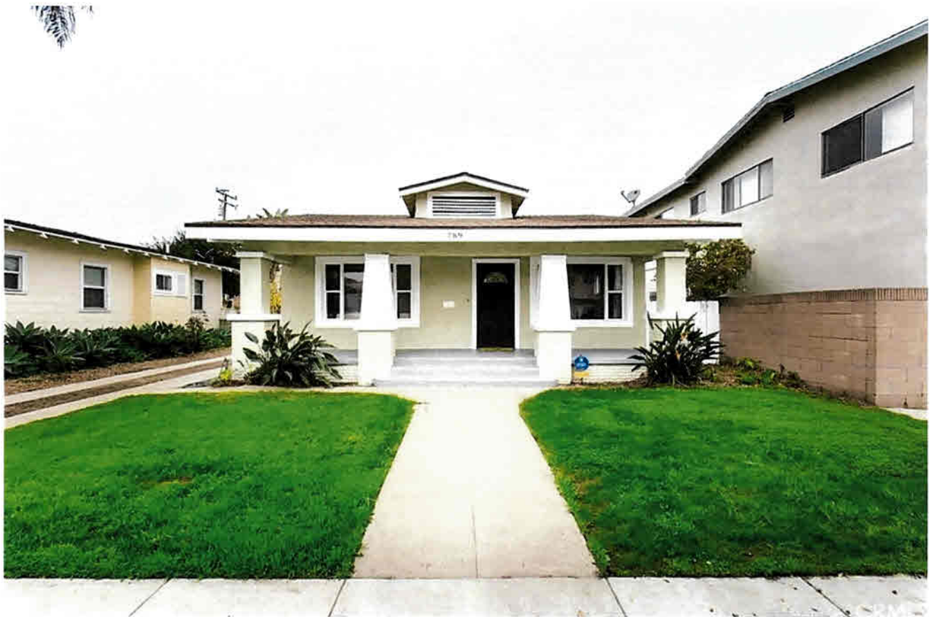
789 Coronado Ave 2017