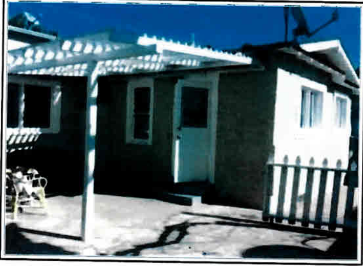
Front of Subject