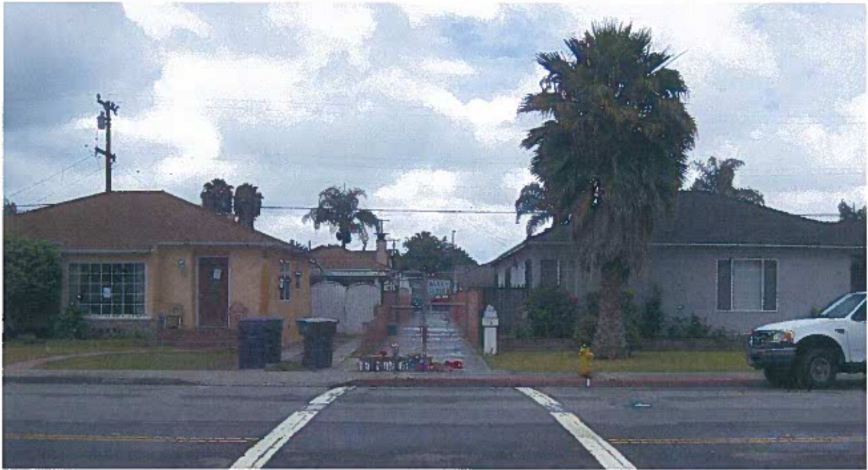
Harding Street: South Facing.