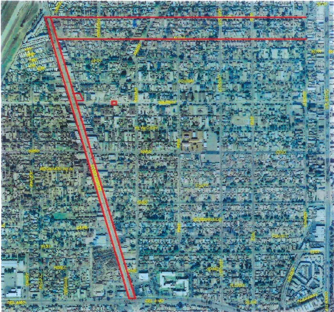
Exhibit A – Site Map Long Beach Boulevard Streetscape Improvements Del Amo Boulevard to 56th Street