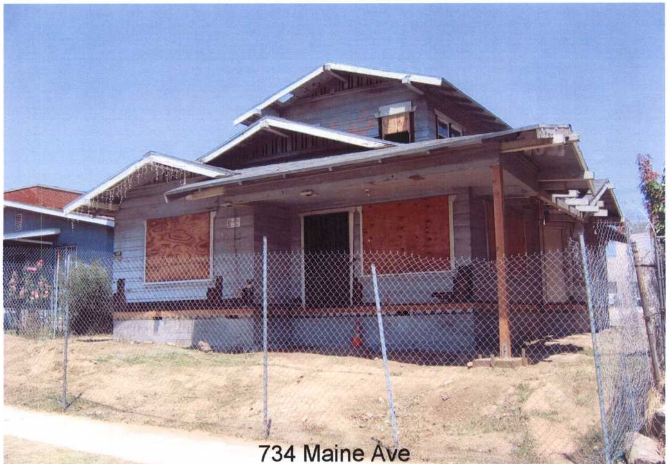
734 Maine Ave