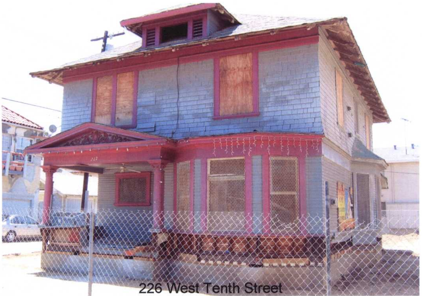
226 West Tenth Street