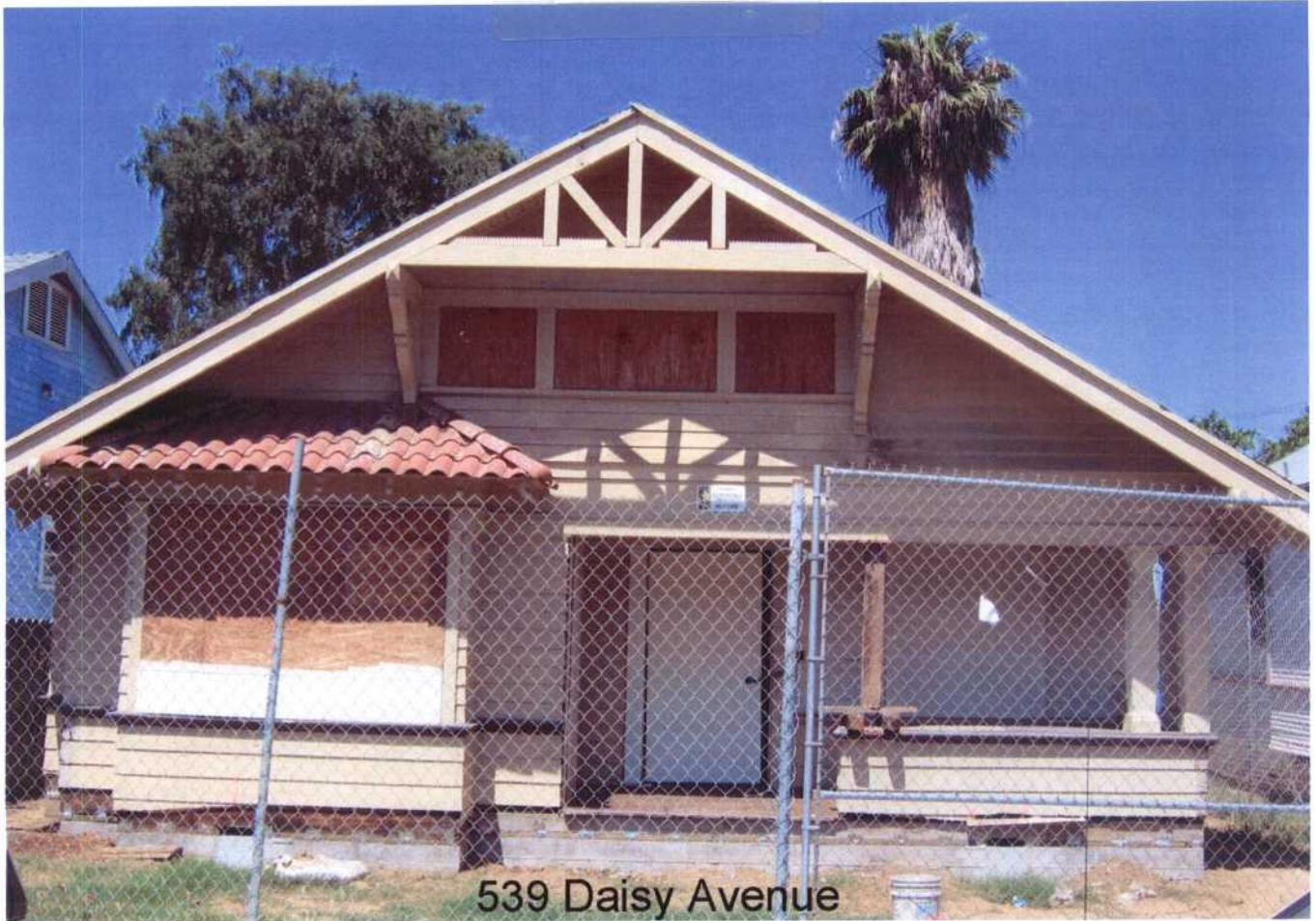
539 Daisy Avenue