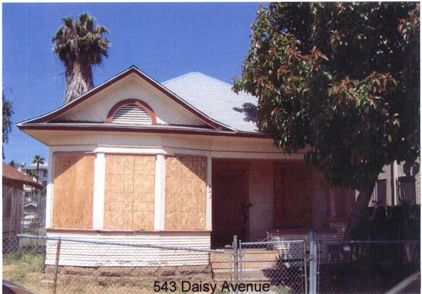
543 Daisy Avenue