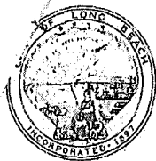
EXHIBIT B CITY OF LONG BEACH NOTICE OF EXEMPTION

Long Beach Development Services 333 W. Ocean Blvd., 5 th Floor, Long Beach, CA 90802 Information: (562) 570-6194 Fax: (562) 570-6068 www.longbeach.gov/plan