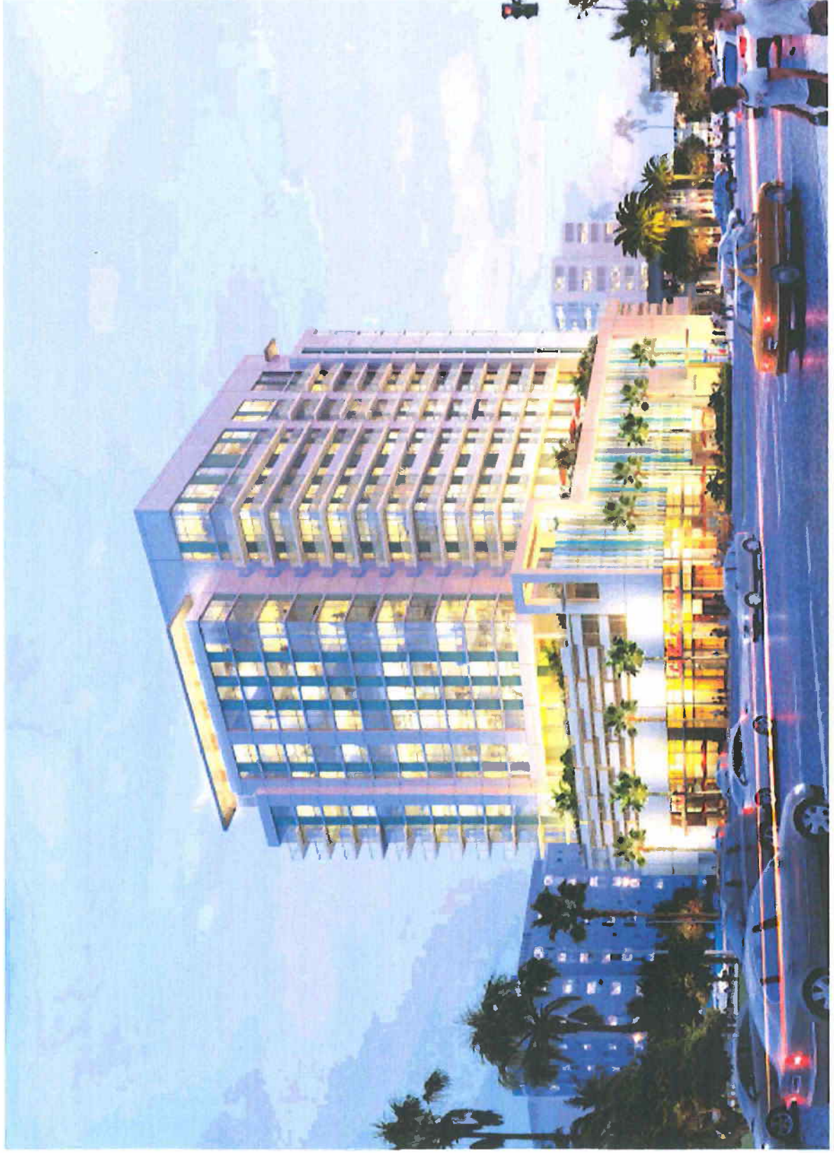
Exhibit D – Shoreline Gateway Phase One (West Tower)