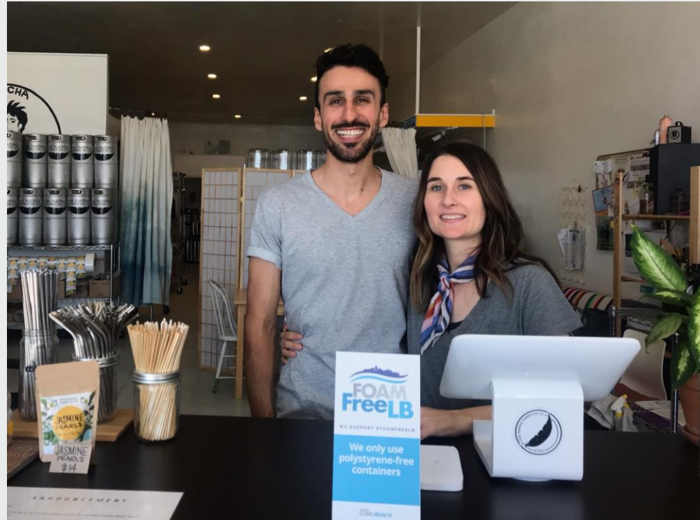
Fine Feathers 2296 Long Beach Blvd.