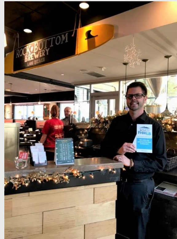
Rock Bottom Brewery