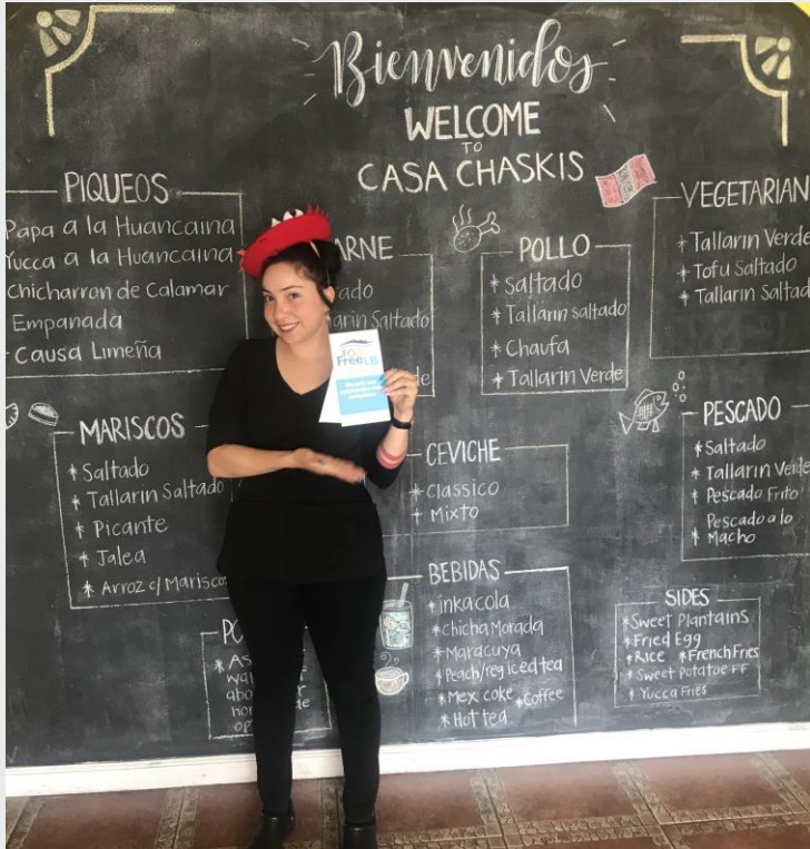
Casa Chaskis 2380 Santa Fe Ave.