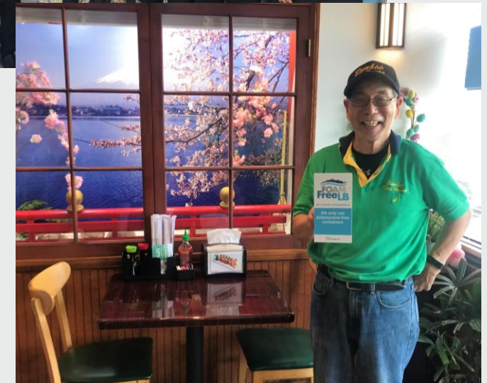
Bamboo Teri House