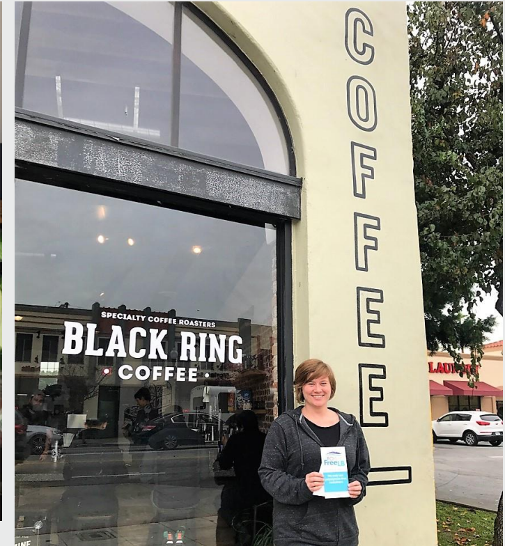
Black Ring Coffee Roasters 5373 Long Beach Blvd.