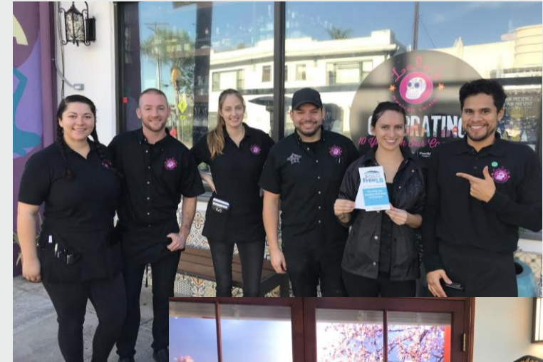
Lola's Mexican Cuisine