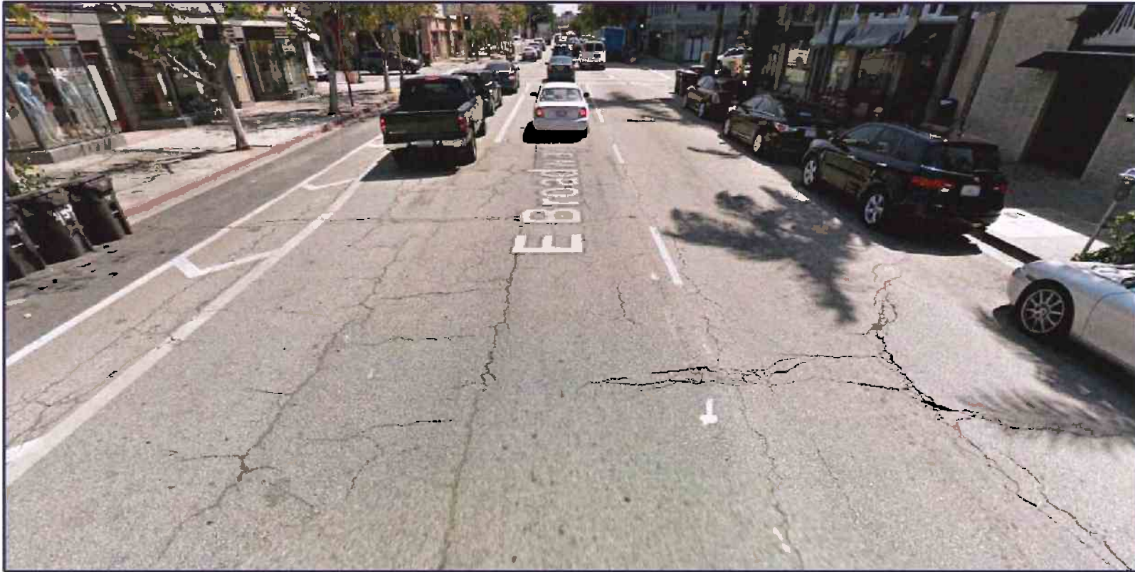
E. Broadway from Elm Ave to Linden Ave.